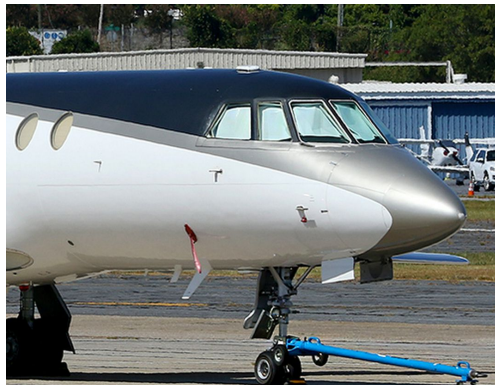
Dassault Falcon 50 Cockpit HeatShields