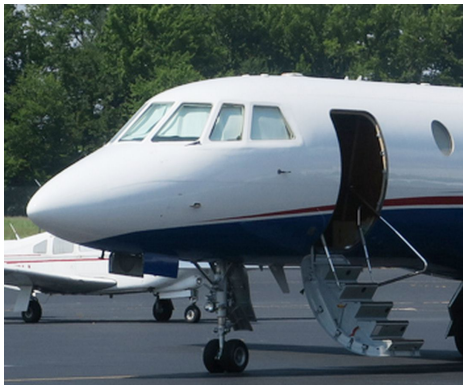
Dassault Falcon 50 Cockpit HeatShields

Cockpit Heatshields are interior sunshades for the aircraft's cockpit. The product is a unique composite of closed-cell foam with a silver mylar finish. The semi-rigid design is stiff enough to stand inside the window framing. The set folds up flat and is easily stored in the included storage sleeve. Some designs may require velcro and suction cups. Our Heatshields for jets are offered white side out because some aircraft manufacturers have issued advisories against reflective window inserts due to potential heat damage. A Heatshield is an excellent short-term remedy for cockpit overheating, but an external fabric cover is more effective for long-term protection.