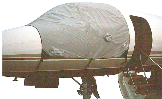
Falcon 50 Windshield Cover

This cover type is made from Silver Acrylic Sunbrella canvas and is 100% lined with a soft and smooth microfiber. Bruce's Custom Covers developed this material combination especially for aircraft protection. The outer material is medium weight and treated for water resistance, UV resistance and anti-static buildup. The inner lining is a very soft and smooth microfiber to prevent scratching. The material is very reflective, and tests show that the cabin interior temperature can be reduced to near-ambient temperature on the hottest of days. It is water, ice and snow repellent, yet breathable to allow moisture to escape from between the cover and the aircraft surface.