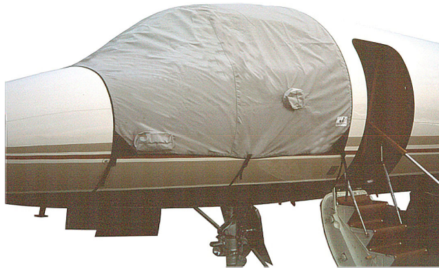
Falcon 50 Windshield Cover