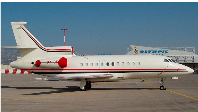
Falcon 900 Engine Covers

The Falcon Jet 50EX Bikini Style Engine Covers are a single-piece design using a soft and smooth stretchy and fabric. The cover stretches tightly over both the intake and exhaust, installing quickly and easily. These covers are designed to be used as hangar dust covers and have a useful life of approximately one year.