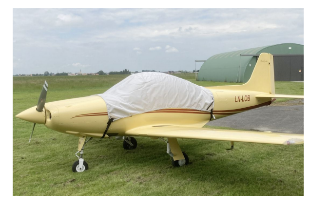
Sequoia Falco Canopy Cover