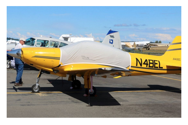
Sequoia Falco Travel Weight Canopy Cover

Travel Covers are made with Silver Solution-Dyed Polyester fabric and only lined over the windshield to save weight. The material is lightweight and more compact for easy stowage in the aircraft. The polyester material is water resistant, but only intended for occasional use outside. We also have an ultra lightweight material available for fitted hangar dust covers. For daily outdoor use, the non-travel Sunbrella Cover is the best choice.