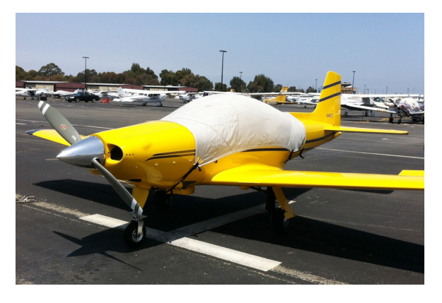
Falco Canopy Cover

This cover type is made from Silver Acrylic Sunbrella canvas and is 100% lined with a soft and smooth microfiber. Bruce's Custom Covers developed this material combination especially for aircraft protection. The outer material is medium weight and treated for water resistance, UV resistance and anti-static buildup. The inner lining is a very soft and smooth microfiber to prevent scratching. The material is very reflective, and tests show that the cabin interior temperature can be reduced to near-ambient temperature on the hottest of days. It is water, ice and snow repellent, yet breathable to allow moisture to escape from between the cover and the aircraft surface.