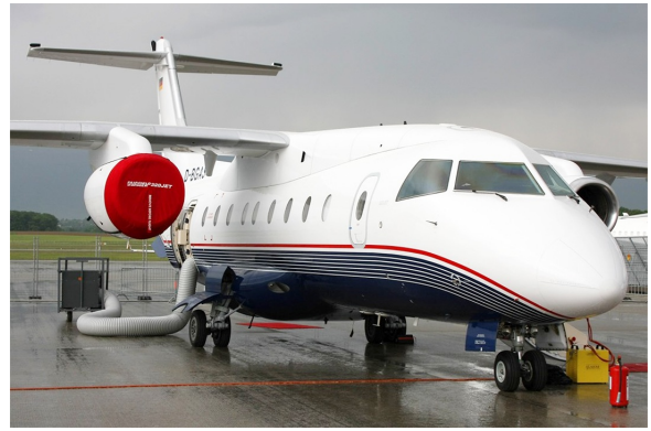
Fairchild/Dornier 328 Engine Covers