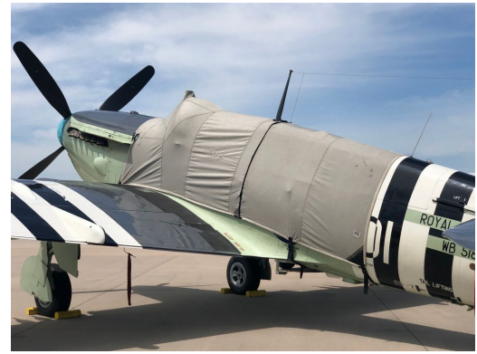
Fairey Firefly Canopy Cover