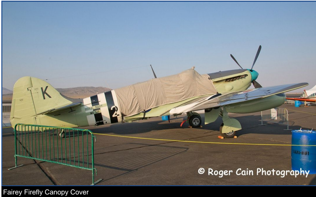
Fairey Firefly Canopy Cover