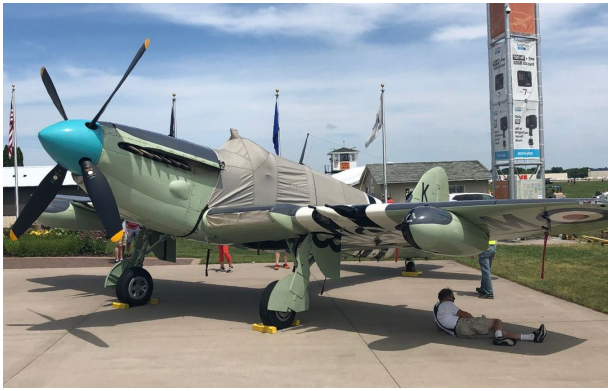
Fairey Firefly Canopy Cover