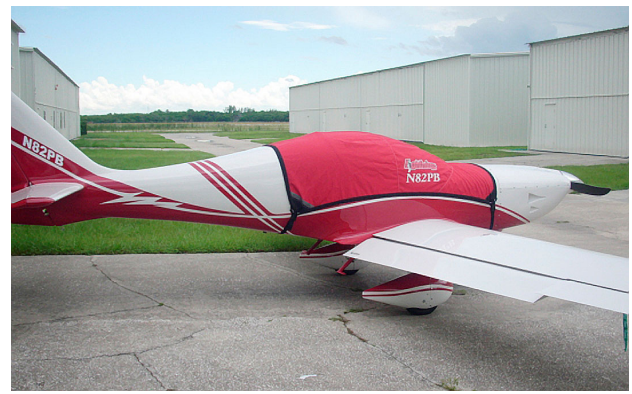
Lightning Canopy Cover