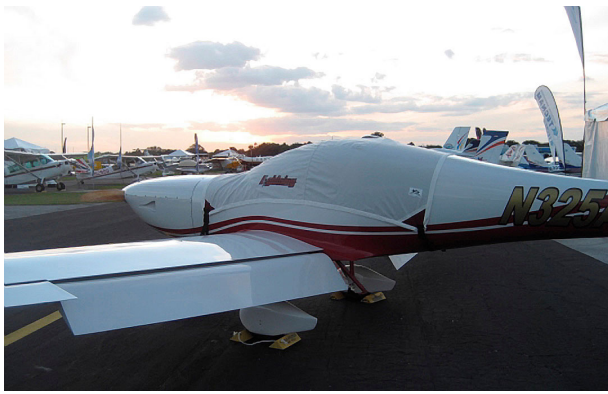
Arion Lightning Canopy Cover