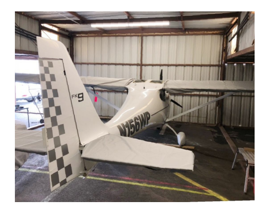
FK 9 MARK IV Wing & Horizontal Stabilizer Dust Covers

This cover type is made from Silver Acrylic Sunbrella canvas and is 100% lined with a soft and smooth microfiber. Bruce's Custom Covers developed this material combination especially for aircraft protection. The outer material is medium weight and treated for water resistance, UV resistance and anti-static buildup. The inner lining is a very soft and smooth microfiber to prevent scratching. The material is very reflective, and tests show that the cabin interior temperature can be reduced to near-ambient temperature on the hottest of days. It is water, ice and snow repellent, yet breathable to allow moisture to escape from between the cover and the aircraft surface.