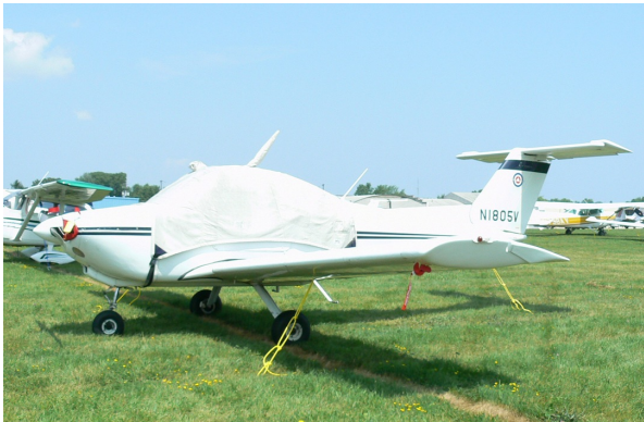
Beech Skipper Canopy Cover, Engine Plugs