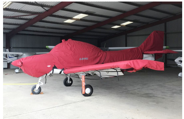
FLS Club Sprint Engine Cover