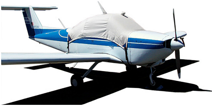
Canopy Cover for Beech Skipper

Covers developed this material combination especially for aircraft protection. The outer material is medium weight and treated for water resistance, UV resistance and anti-static buildup. The inner lining is a very soft and smooth microfiber to prevent scratching. The material is very reflective, and tests show that the cabin interior temperature can be reduced to near-ambient temperature on the hottest of days. It is water, ice and snow repellent, yet breathable to allow moisture to escape from between the cover and the aircraft surface.