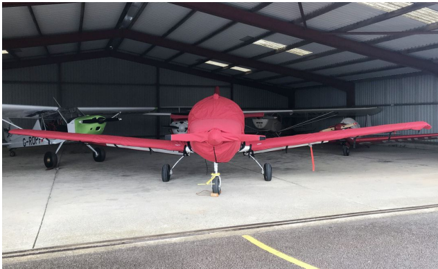
FLS Club Sprint Empennage Cover (Tailboom, Vertical & Horiz Stabilizers) All Year Use

Covers developed this material combination especially for aircraft protection. The outer material is medium weight and treated for water resistance, UV resistance and anti-static buildup. The inner lining is a very soft and smooth microfiber to prevent scratching. The material is very reflective, and tests show that the cabin interior temperature can be reduced to near-ambient temperature on the hottest of days. It is water, ice and snow repellent, yet breathable to allow moisture to escape from between the cover and the aircraft surface.