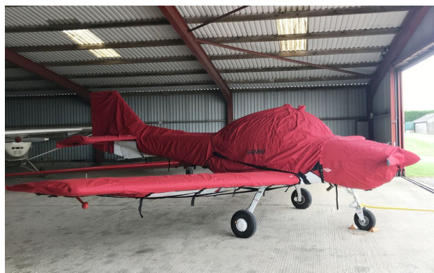
FLS Club Sprint Extended Canopy Cover