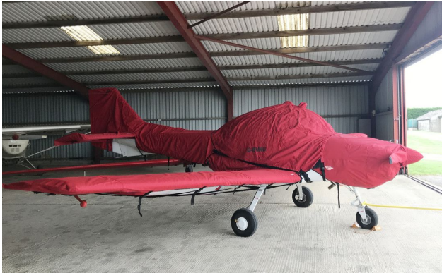
FLS Club Sprint Extended Canopy Cover

Engine Covers will cinch around or behind the spinner, cover the entire engine cowl area including the engine air cooling and induction air inlets, and fastens together with Velcro beneath the spinner down the front of the cowling. The Engine Cover is attached with a belly strap aft of the firewall, and can Velcro to the Canopy Cover. Engine Covers are normally made from Solution-Dyed Polyester or Acrylic Sunbrella . An Insulated version of the engine cover can be made with a thicker, quilted, and water-repellent material. The Insulated Engine Cover works well in cold climates to help with engine preheating.