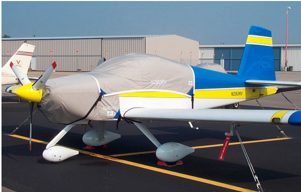
Van's RV-9 Canopy & Engine Covers