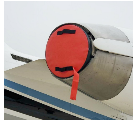
Gulfstream G100 Exhaust Plugs