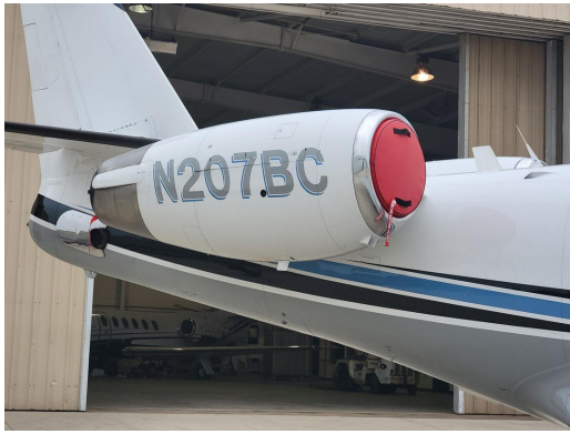
Gulfstream G100 Intake Plugs