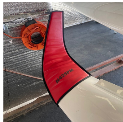
Stemme S-10 & S-12 Wingtip Pads