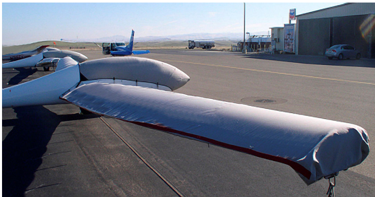
Grob 103 Canopy/Nose Cover and Wing Covers

WINTER USE MATERIAL - Made with Solution-Dyed Polyester fabric, this option is intended for seasonal use to aid in deicing, rain mitigation, or for occasional travel. The material is lighter and more compact, but more susceptible to UV damage and may have a shorter useful life if used continuously outside than the all-year use material.