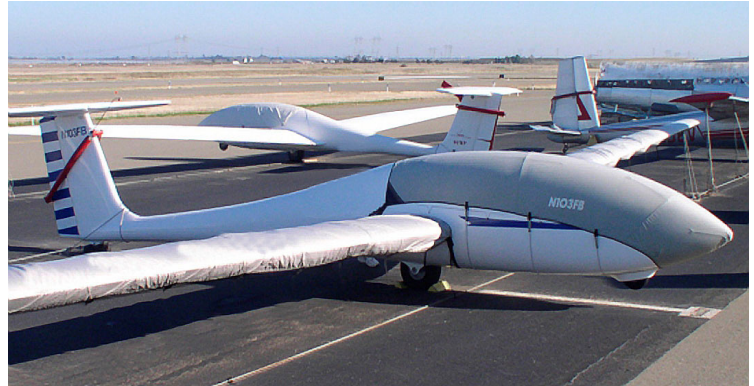
Grob 103 Canopy/Nose Cover and Wing Covers