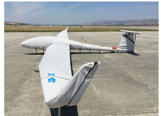
Schempp-Hirth Discus 2B Full Cover Set