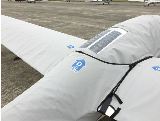
DG-505 Full Cover Set

This cover type is made from Silver Acrylic Sunbrella canvas and is 100% lined with a soft and smooth microfiber. Bruce's Custom Covers developed this material combination especially for aircraft protection. The outer material is medium weight and treated for water resistance, UV resistance and anti-static buildup. The inner lining is a very soft and smooth microfiber to prevent scratching. The material is very reflective, and tests show that the cabin interior temperature can be reduced to near-ambient temperature on the hottest of days. It is water, ice and snow repellent, yet breathable to allow moisture to escape from between the cover and the aircraft surface.