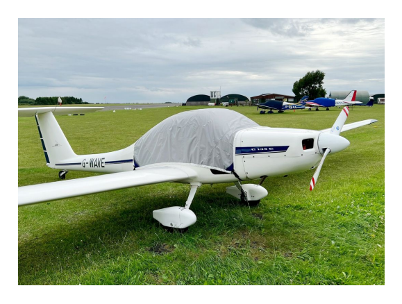
Grob 109 Travel Cover, Light Weight Canopy Cover