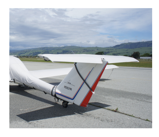
Grob 109 Horizontal Stabilizer Cover