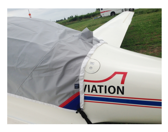
Grob 109 Travel Cover, Light Weight Travel Canopy Cover