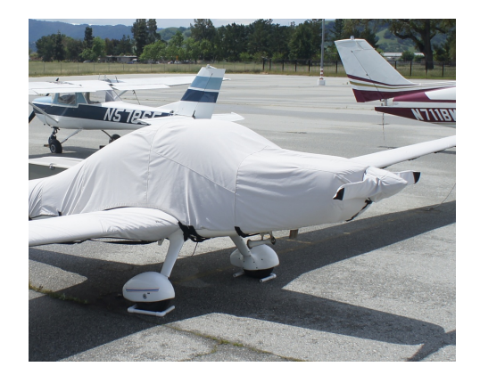
Grob 109 Prop Cover