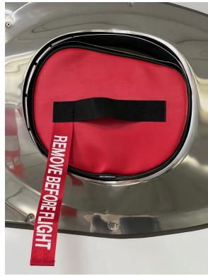
Gulfstream V APU Exhaust Plug

The Engine Inlet Plugs are custom fit for your Gulfstream Aerospace Gulfstream G150 intakes, made with heavy-duty vinyl material, and stuffed with a single block of sculpted urethane foam. Each plug has a zipper that allows the foam to be removed and dried if necessary. Engine plugs have 'remove before flight' streamers sewn onto the face of the plugs. Most plugs are imprinted with the aircraft registration number in black for an extra charge. Storage bag NOT included. Engine plugs may be inserted after flight when the engine is still warm. Engine Inlet Plugs are commonly referred to as Cowl Plugs, Intake Plugs, Cowl Blocks, Engine Blocks, and Engine Bungs.