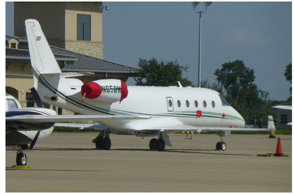
Gulfstream G150 Engine Cover Set