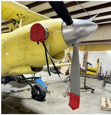
Schweizer Ag-Cat Prop Tie/Exhaust Cover Set