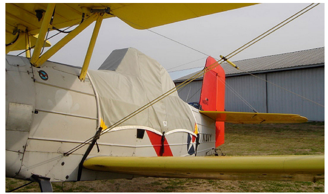
Ag-Cat Canopy Cover