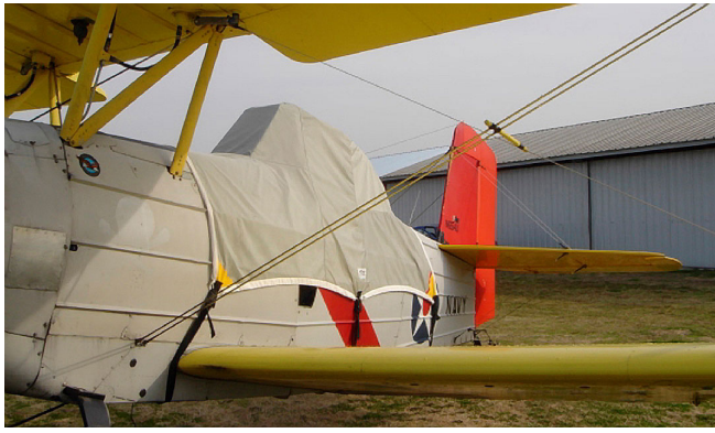
Ag-Cat Canopy Cover