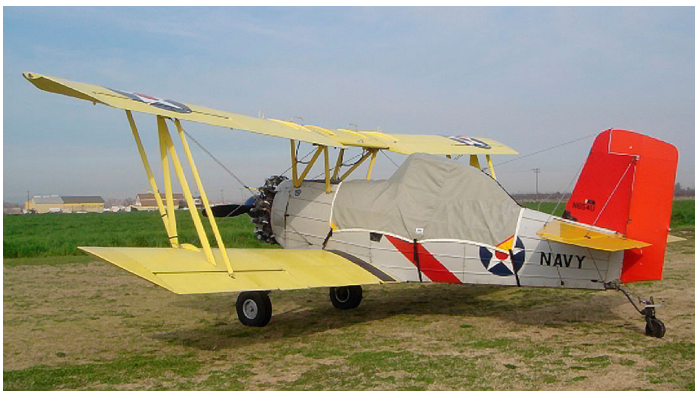
Canopy Cover for the Grumman Ag Cat