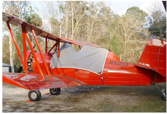
Grumman Ag Cat G-164, Open Cockpit, Canopy Cover