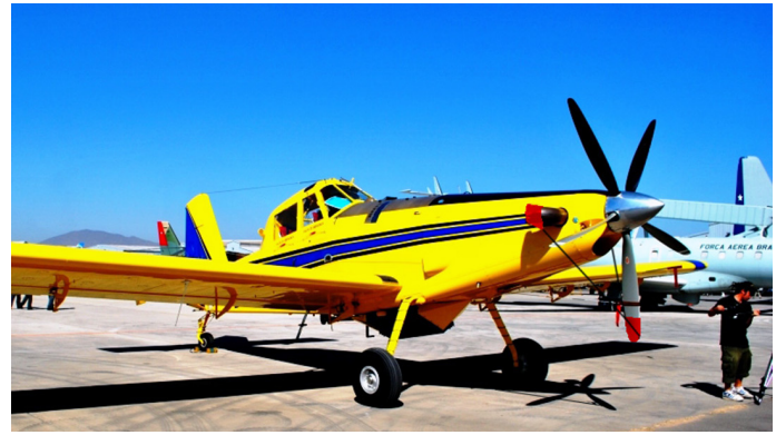
Air Tractor Prop Tie/Exhaust Covers