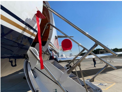
Grumman Gulfstream G-IV SP Pitot Cover

The Engine Inlet Plugs are custom fit for your Gulfstream Aerospace Gulfstream II, III (C-20D) intakes, made with heavy-duty vinyl material, and stuffed with a single block of sculpted urethane foam. Each plug has a zipper that allows the foam to be removed and dried if necessary. Engine plugs have 'remove before flight' streamers sewn onto the face of the plugs. Most plugs are imprinted with the aircraft registration number in black for an extra charge. Storage bag NOT included. Engine plugs may be inserted after flight when the engine is still warm. Engine Inlet Plugs are commonly referred to as Cowl Plugs, Intake Plugs, Cowl Blocks, Engine Blocks, and Engine Bunges.