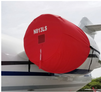
Grumman Gulfstream G-II Intake Covers

The Gulfstream Aerospace Gulfstream II, III (C-20D) Intake Covers are designed to install easily yet be completely storable. A spring steel hoop is sewn into the hem of each cover, allowing them to be installed without climbing onto the wing or using a stepladder. To store the covers the spring steel hoop folds like a band-saw blade into three nesting rings. Each cover folds into a compact circular bundle which is stored in the included duffle bag, yet they unfold quickly for use. The Tri-Fold Ring cover is made of medium weight nylon which is available in a variety of colors to match the paint trim. Each cover set comes complete with installation and folding instructions. The aircraft's registration number can be silkscreened onto the cover for an extra charge.