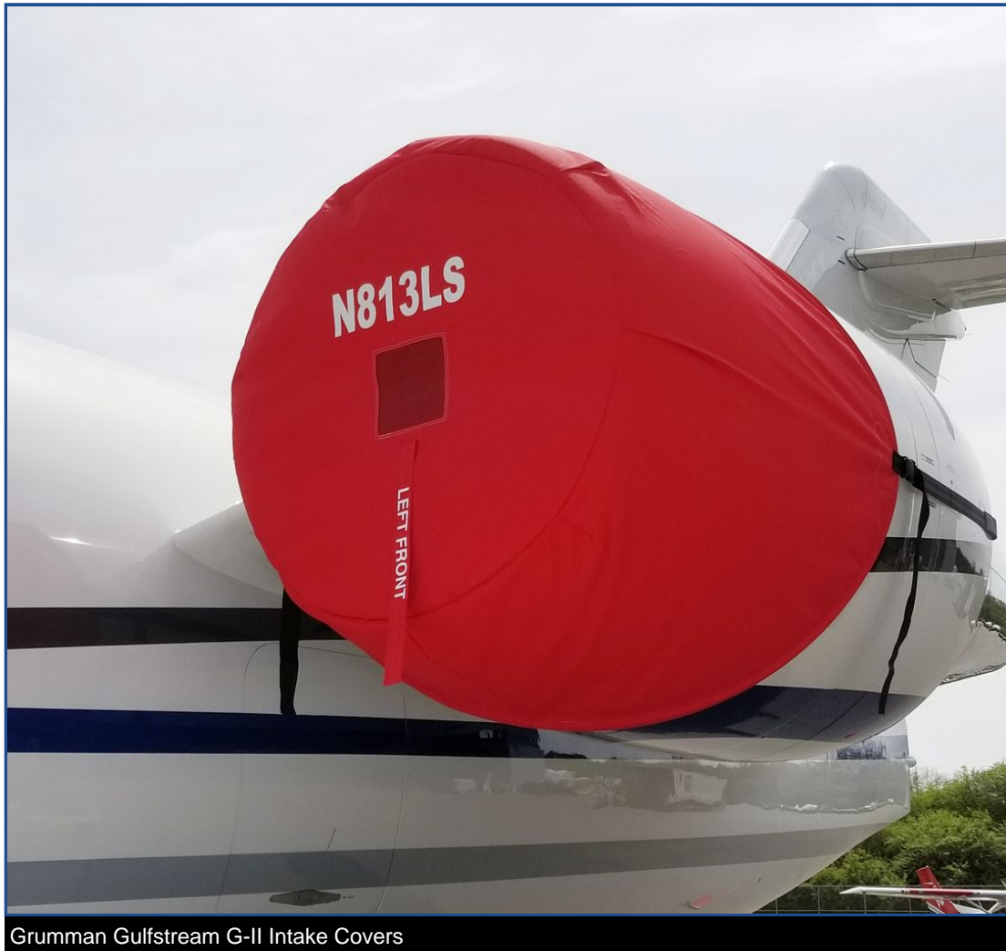
Grumman Gulfstream G-II Intake Covers