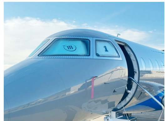
Gulfstream G200 Cockpit Heatshields