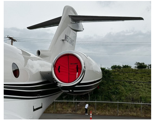
Gulfstream G280 Intake Plugs