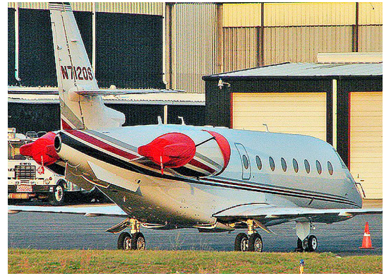
Gulfstream 200 Engine Cover set