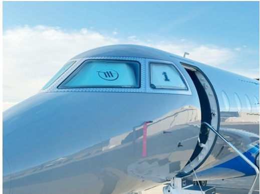
Gulfstream G200 Cockpit Heatshields