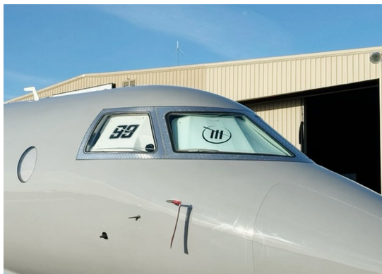
Gulfstream G200 Cockpit Heatshields

Cockpit Heatshields are interior sunshades for the aircraft's cockpit. The product is a unique composite of closed-cell foam with a silver mylar finish. The semi-rigid design is stiff enough to stand inside the window framing. The set folds up flat and is easily stored in the included storage sleeve. Some designs may require velcro and suction cups. Our Heatshields for jets are offered white side out because some aircraft manufacturers have issued advisories against reflective window inserts due to potential heat damage. A Heatshield is an excellent short-term remedy for cockpit overheating, but an external fabric cover is more effective for long-term protection.