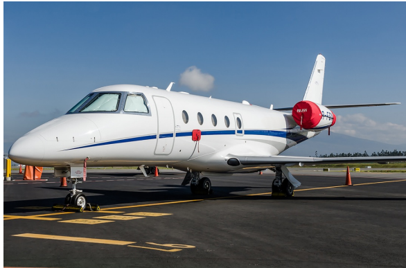
Gulfstream G150 Engine Covers, Cockpit HeatShields

Cockpit Heatshields are interior sunshades for the aircraft's cockpit. The product is a unique composite of closed-cell foam with a silver mylar finish. The semi-rigid design is stiff enough to stand inside the window framing. The set folds up flat and is easily stored in the included storage sleeve. Some designs may require velcro and suction cups. Our Heatshields for jets are offered white side out because some aircraft manufacturers have issued advisories against reflective window inserts due to potential heat damage. A Heatshield is an excellent short-term remedy for cockpit overheating, but an external fabric cover is more effective for long-term protection.