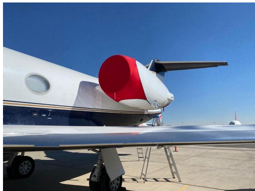
Grumman Gulfstream G-IV SP Engine Cover, bikini type

The Gulfstream Aerospace Gulfstream GVII (G400, G500, G600, G700, G800) Bikini Style Engine Covers are a single-piece design using a soft and smooth stretchy fabric. The cover stretches tightly over both the intake and exhaust, installing quickly and easily. These covers are designed to be used as hangar dust covers and have a useful life of approximately one year.