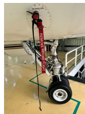
G400 TAT/ID Covers