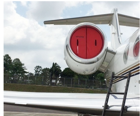
Grumman Gulfstream G450 Intake Plugs