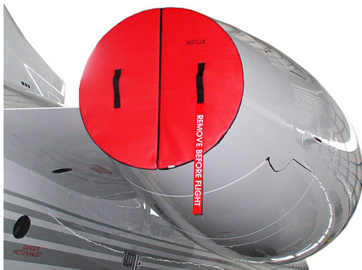
Global Express Exhaust Plugs

The Engine Inlet Plugs are custom fit for your Gulfstream Aerospace Gulfstream GVII (G400, G500, G600, G700, G800) intakes, made with heavy-duty vinyl material, and stuffed with a single block of sculpted urethane foam. Each plug has a zipper that allows the foam to be removed and dried if necessary. Engine plugs have 'remove before flight' streamers sewn onto the face of the plugs. Most plugs are imprinted with the aircraft registration number in black for an extra charge. Storage bag NOT included. Engine plugs may be inserted after flight when the engine is still warm. Engine Inlet Plugs are commonly referred to as Cowl Plugs, Intake Plugs, Cowl Blocks, Engine Blocks, and Engine Bungs.