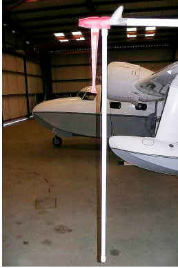
Grumman Mallard Pitot Cover with Install Tool

water resistance, UV resistance and anti-static buildup. The inner lining is a very soft and smooth microfiber to prevent scratching. The material is very reflective, and tests show that the cabin interior temperature can be reduced to near-ambient temperature on the hottest of days. It is water, ice and snow repellent, yet breathable to allow moisture to escape from between the cover and the aircraft surface.