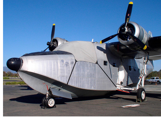
Canopy Cover for the Grumman HU-16 Albatross