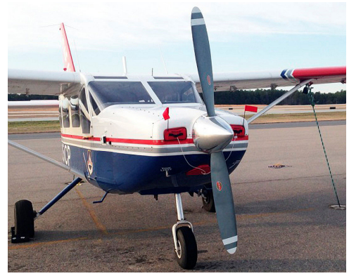
GA-8 Engine Inlet Plugs (set of 3)