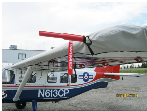
Gippsland GA-8 Airvan Wing Covers, Pitot Cover