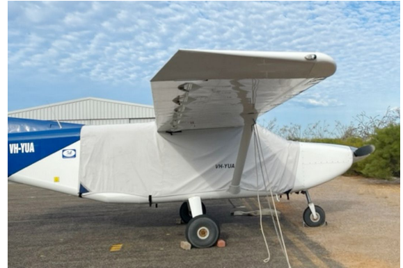
Gippsland GA-8 Extended Canopy Cover