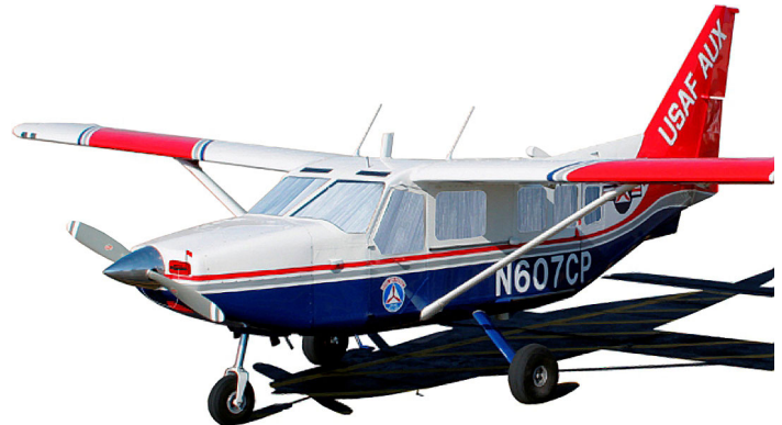
Covers, Plugs & HeatShields for the Gippsland GA-8 Airvan