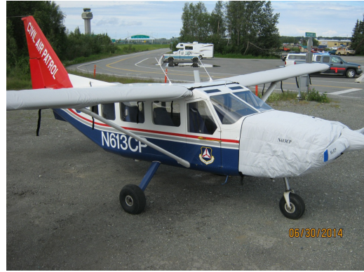
Gippsland GA-8 Airvan Insulated Engine, Wing and Prop Covers