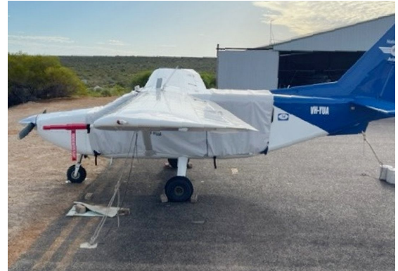
Gippsland GA-8 Extended Canopy Cover