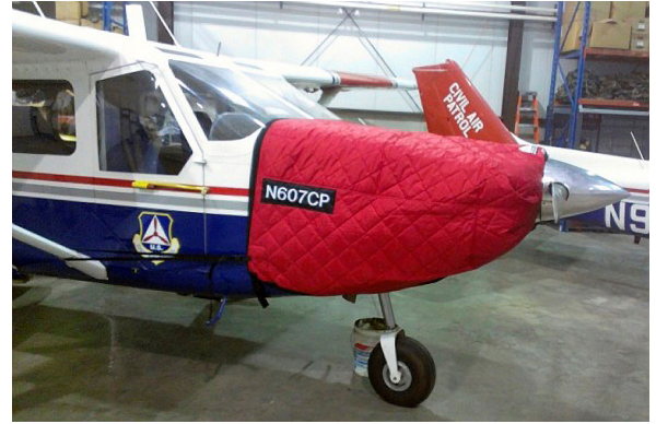
GA-8 Insulated Engine Cover