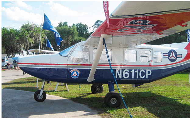
Gippsland GA-8 Airvan Cockpit & Cabin HeatShield Set

Cockpit Heatshields are interior sunshades for the aircraft's cockpit. The product is a unique composite of closed-cell foam with a silver mylar finish. The semi-rigid design is stiff enough to stand inside the window framing. The set folds up flat and is easily stored in the included storage sleeve. Some designs may require velcro and suction cups. A Heatshield is an excellent short-term remedy for cockpit overheating, but an external fabric cover is more effective for long-term protection.