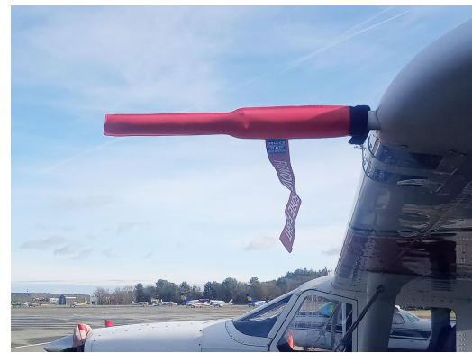
Gippsland GA-8 Airvan Pitot Cover