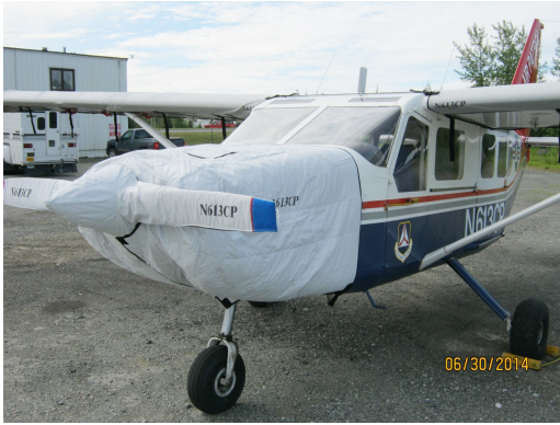
Gippsland GA-8 Airvan Insulated Engine and Prop Covers

This cover type is made from Silver Acrylic Sunbrella canvas and is 100% lined with a soft and smooth microfiber. Bruce's Custom Covers developed this material combination especially for aircraft protection. The outer material is medium weight and treated for water resistance, UV resistance and anti-static buildup. The inner lining is a very soft and smooth microfiber to prevent scratching. The material is very reflective, and tests show that the cabin interior temperature can be reduced to near-ambient temperature on the hottest of days. It is water, ice and snow repellent, yet breathable to allow moisture to escape from between the cover and the aircraft surface.