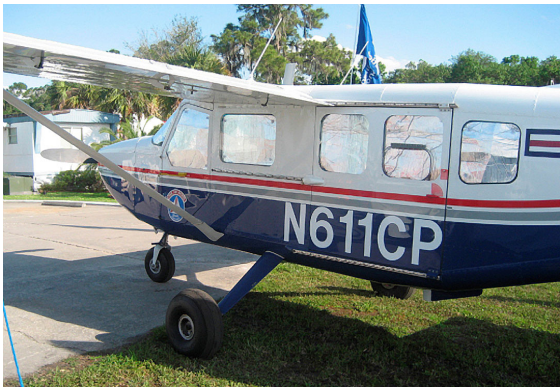
Gippsland GA-8 Airvan Cockpit & Cabin HeatShield Set

Cockpit Heatshields are interior sunshades for the aircraft's cockpit. The product is a unique composite of closed-cell foam with a silver mylar finish. The semi-rigid design is stiff enough to stand inside the window framing. The set folds up flat and is easily stored in the included storage sleeve. Some designs may require velcro and suction cups. A Heatshield is an excellent short-term remedy for cockpit overheating, but an external fabric cover is more effective for long-term protection.