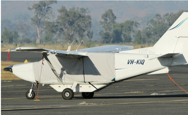
Gippsland GA-8 Airvan Extended Canopy Cover

This cover type is made from Silver Acrylic Sunbrella canvas and is 100% lined with a soft and smooth microfiber. Bruce's Custom Covers developed this material combination especially for aircraft protection. The outer material is medium weight and treated for water resistance, UV resistance and anti-static buildup. The inner lining is a very soft and smooth microfiber to prevent scratching. The material is very reflective, and tests show that the cabin interior temperature can be reduced to near-ambient temperature on the hottest of days. It is water, ice and snow repellent, yet breathable to allow moisture to escape from between the cover and the aircraft surface.