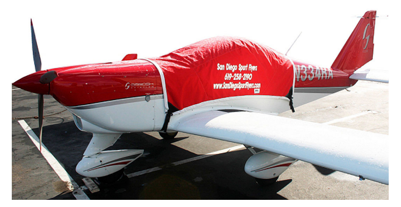
Gobosh Canopy Cover with custom Imprint