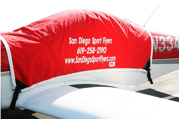
Gobosh Canopy Cover with custom Imprint