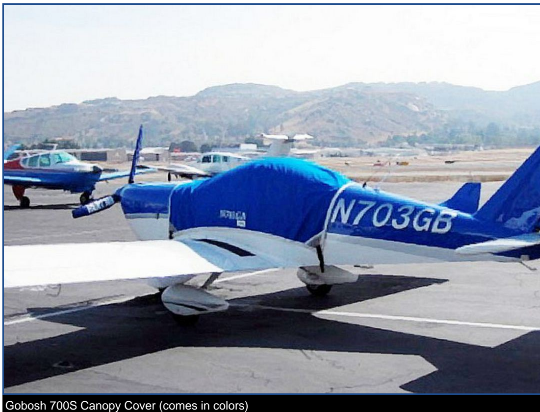
Gobosh 700S Canopy Cover (comes in colors)