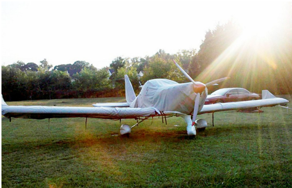
Gobosh Full Cover Set

WINTER USE MATERIAL - Made with Solution-Dyed Polyester fabric, this option is intended for seasonal use to aid in deicing, rain mitigation, or for occasional travel. The material is lighter and more compact, but more susceptible to UV damage and may have a shorter useful life if used continuously outside than the all-year use material.