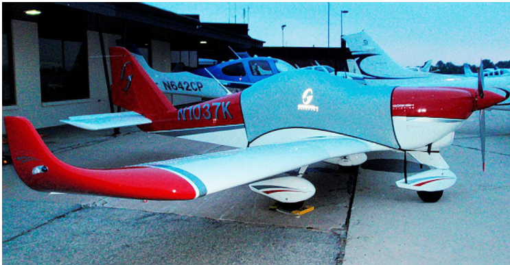
Gobosh Light Weight Travel-Cover