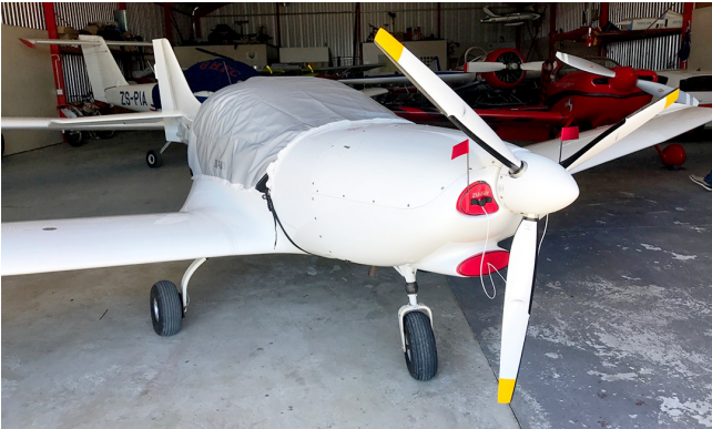
Gobosh 800XP Travel Cover, Light Weight Travel Canopy Cover and Inlet Plugs

Engine Inlet Plugs are custom fit for your Gobosh 800XP intakes, made with heavy-duty vinyl material, and stuffed with a single block of sculpted urethane foam. Each plug has a zipper that allows the foam to be removed and dried if necessary. Engine plugs have warning flags that are visible from the cockpit or 'remove before flight' streamers sewn onto the face of the plugs. Most plugs are imprinted with the aircraft registration number in black for an extra charge. Storage bag NOT included. Engine plugs may be inserted after flight when the engine is still warm. Engine Inlet Plugs are commonly referred to as Cowl Plugs, Intake Plugs, Cowl Blocks, Engine Blocks, and Engine Bungs.