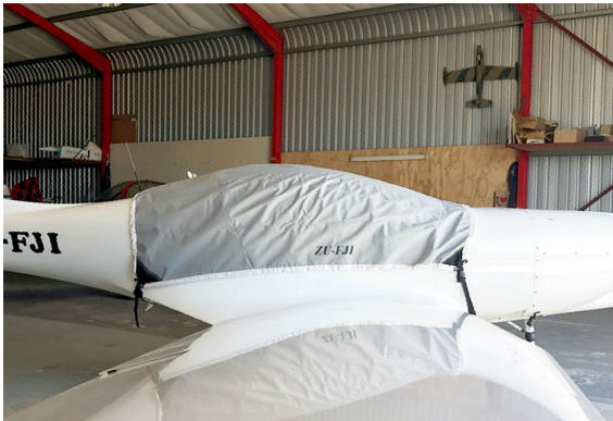
Gobosh 800XP Travel Cover, Light Weight Travel Canopy Cover

Travel Covers are made with Silver Solution-Dyed Polyester fabric and only lined over the windshield to save weight. The material is lightweight and more compact for easy stowage in the aircraft. The polyester material is water resistant, but only intended for occasional use outside. We also have an ultra lightweight material available for fitted hangar dust covers. For daily outdoor use, the non-travel Sunbrella Cover is the best choice.