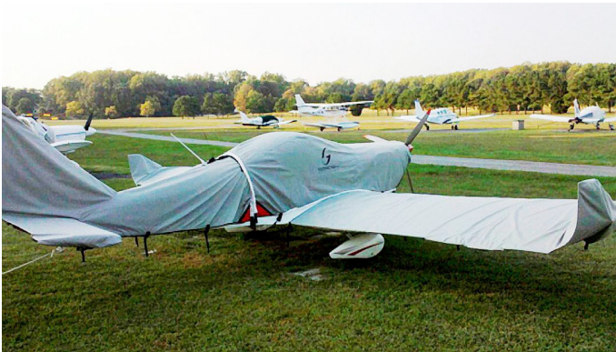
Gobosh Full Cover Set