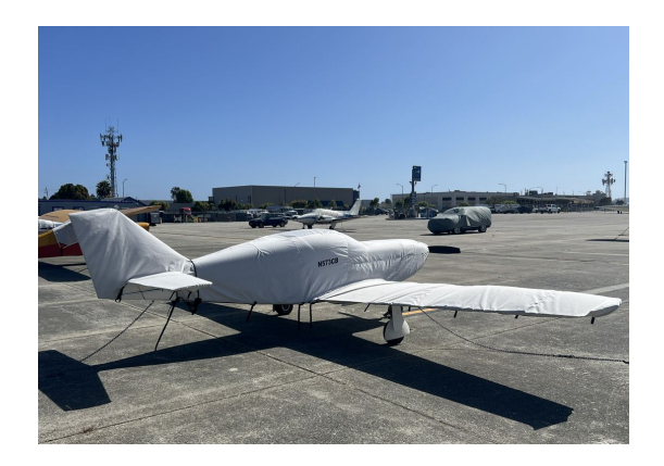
Glasair II Complete Cover Set

This cover type is made from Silver Acrylic Sunbrella canvas and is 100% lined with a soft and smooth microfiber. Bruce's Custom Covers developed this material combination especially for aircraft protection. The outer material is medium weight and treated for water resistance, UV resistance and anti-static buildup. The inner lining is a very soft and smooth microfiber to prevent scratching. The material is very reflective, and tests show that the cabin interior temperature can be reduced to near-ambient temperature on the hottest of days. It is water, ice and snow repellent, yet breathable to allow moisture to escape from between the cover and the aircraft surface.