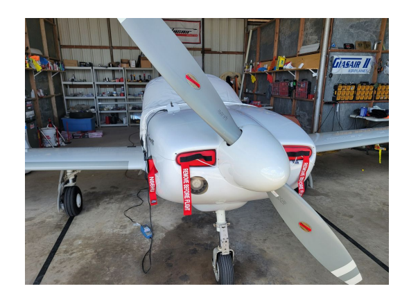
GLASAIR S2-RG Canopy Cover, Engine Plugs