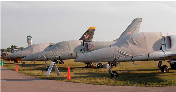
L-39 Canopy/Nose Covers & Plugs