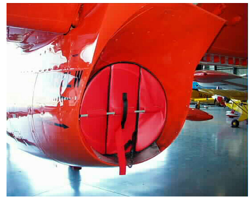
Exhaust Plug, folding type