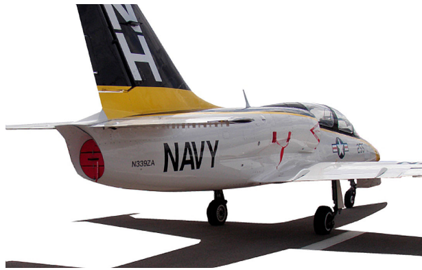
L-39 Exhaust Plug