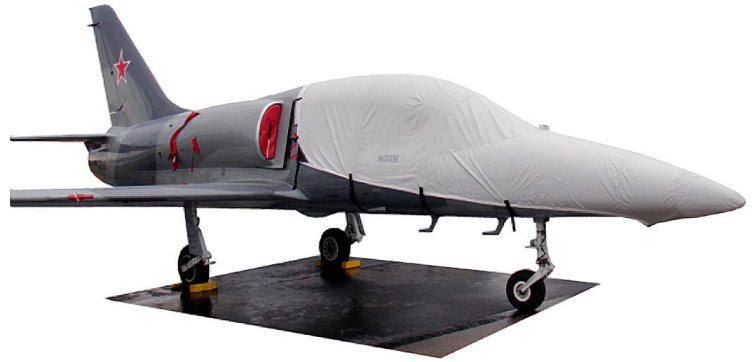
L-39 Canopy/Nose Cover & Plugs