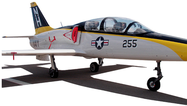
L-39 Intake Plugs