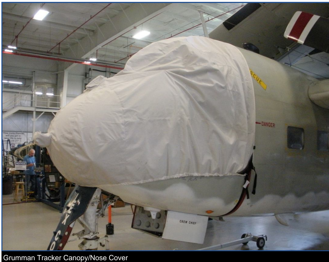
Grumman Tracker Canopy/Nose Cover