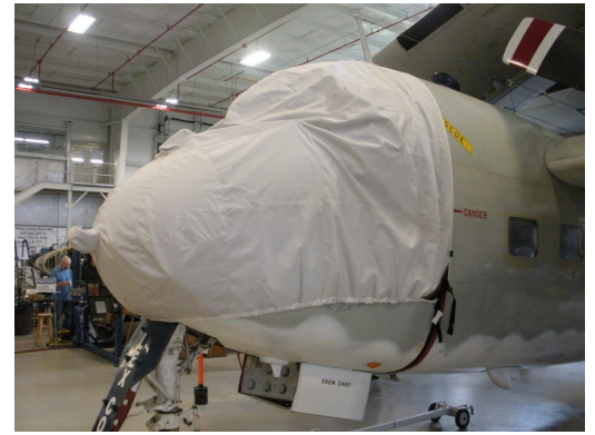
Grumman Tracker Canopy/Nose Cover