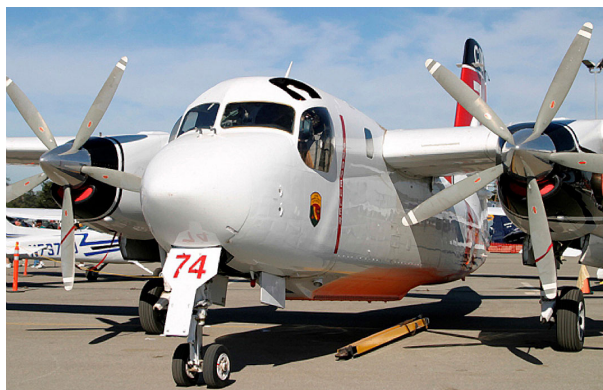
Grumman Tracker Engine Inlet Plugs

Engine Inlet Plugs are custom fit for your Grumman S-2 Tracker intakes, made with heavy-duty vinyl material, and stuffed with a single block of sculpted urethane foam. Each plug has a zipper that allows the foam to be removed and dried if necessary. Engine plugs have warning flags that are visible from the cockpit or 'remove before flight' streamers sewn onto the face of the plugs. Most plugs are imprinted with the aircraft registration number in black for an extra charge. Storage bag NOT included. Engine plugs may be inserted after flight when the engine is still warm. Engine Inlet Plugs are commonly referred to as Cowl Plugs, Intake Plugs, Cowl Blocks, Engine Blocks, and Engine Bungs.