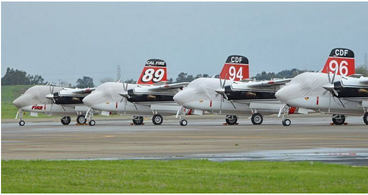
Grumman S2 Tracker Canopy/Nose Covers