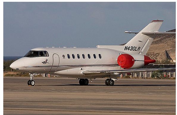
Hawker 1000 Engine Cover Set