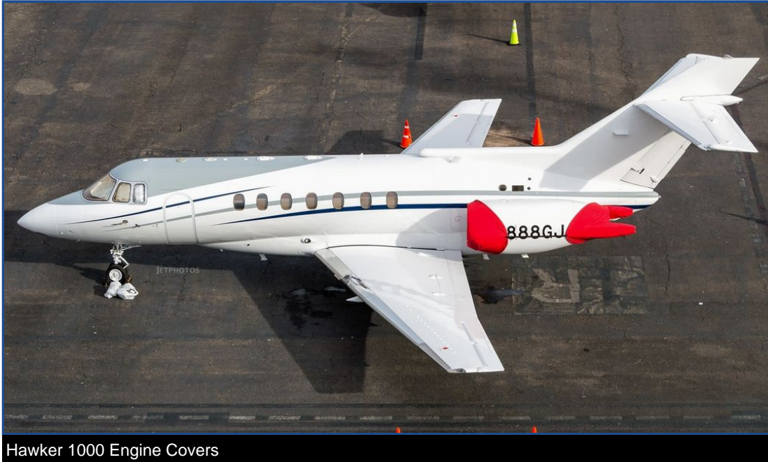
Hawker 1000 Engine Covers