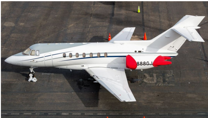
Hawker 1000 Engine Covers