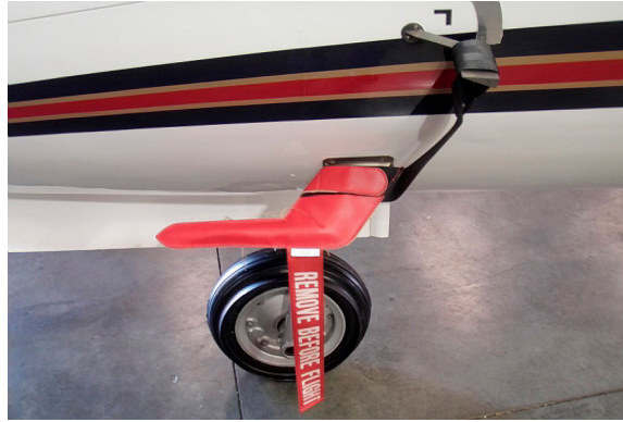
Learjet Pitot Cover and AOA Strap

Hawker Beechcraft 1000 Pitot Tube Covers, NOT HEAT RESISTANT TYPE , are made of Naugahyde vinyl, and are designed to cover the entire pitot assembly. Slipping over the tube, the cover tightens around the base with a Velcro strap detail. A "Remove Before Flight" streamer is attached to the cover. Heat Resistant Pitot Covers are an upgrade to this design, and help prevent the pitot cover from melting onto the tube if the pitot heat is accidentally turned on while installed. If you want the set tethered together, please let us know.