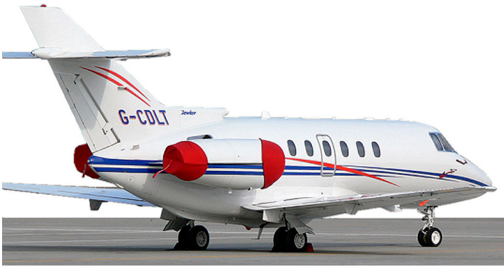
Hawker 800 Tri-Fold Engine Covers