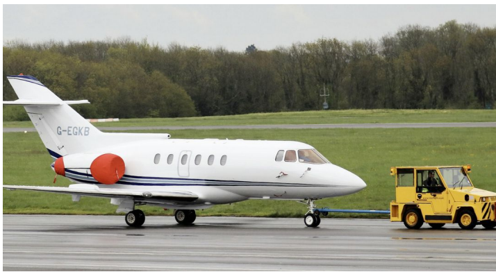
Hawker 800 Tri-Fold Engine Covers.