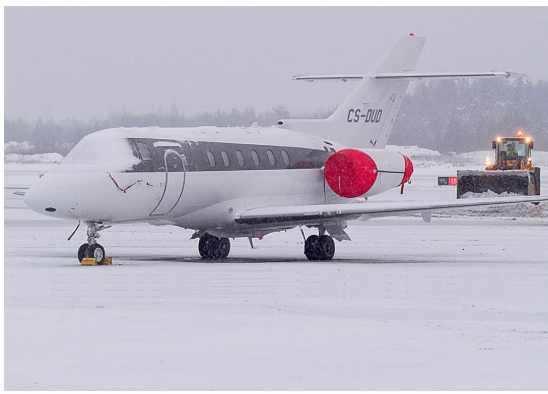
Hawker 750 Engine Cover set