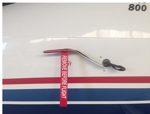
Hawker Beechcraft 800, 800XP, 850XP Pitot Covers With Aoa Straps

The Engine Inlet Plugs are custom fit for your British Aerospace Hawker 700 intakes, made with heavy-duty vinyl material, and stuffed with a single block of sculpted urethane foam. Each plug has a zipper that allows the foam to be removed and dried if necessary. Engine plugs have 'remove before flight' streamers sewn onto the face of the plugs. Most plugs are imprinted with the aircraft registration number in black for an extra charge. Storage bag NOT included. Engine plugs may be inserted after flight when the engine is still warm. Engine Inlet Plugs are commonly referred to as Cowl Plugs, Intake Plugs, Cowl Blocks, Engine Blocks, and Engine Bungs.