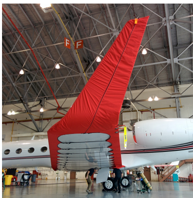
Gulfstream G550 Wing/Winglet Covers

WINTER USE MATERIAL - Made with Solution-Dyed Polyester fabric, this option is intended for seasonal use to aid in deicing, rain mitigation, or for occasional travel. The material is lighter and more compact, but more susceptible to UV damage and may have a shorter useful life if used continuously outside than the all-year use material.