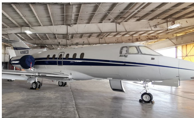
Hawker 750 HeatShields & Engine Covers

Cockpit Heatshields are interior sunshades for the aircraft's cockpit. The product is a unique composite of closed-cell foam with a silver mylar finish. The semi-rigid design is stiff enough to stand inside the window framing. The set folds up flat and is easily stored in the included storage sleeve. Some designs may require velcro and suction cups. Our Heatshields for jets are offered white side out because some aircraft manufacturers have issued advisories against reflective window inserts due to potential heat damage. A Heatshield is an excellent short-term remedy for cockpit overheating, but an external fabric cover is more effective for long-term protection.