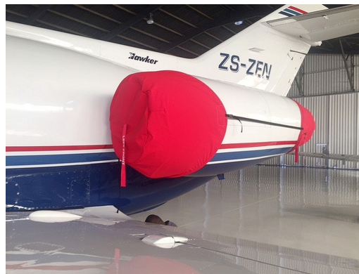
Hawker Beechcraft 800, 800XP, 850XP Engine Covers (With Tr's)