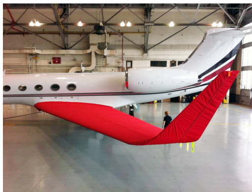
Gulfstream G550 Wing/Winglet Covers