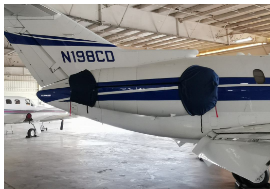
Hawker 750 Engine Covers