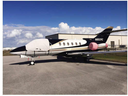
Hawker 800 Cockpit Cover, extended aft 24"