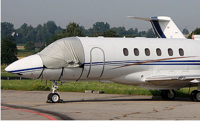
Hawker 800 Cockpit Cover

This cover type is made from Silver Acrylic Sunbrella canvas and is 100% lined with a soft and smooth microfiber. Bruce's Custom Covers developed this material combination especially for aircraft protection. The outer material is medium weight and treated for water resistance, UV resistance and anti-static buildup. The inner lining is a very soft and smooth microfiber to prevent scratching. The material is very reflective, and tests show that the cabin interior temperature can be reduced to near-ambient temperature on the hottest of days. It is water, ice and snow repellent, yet breathable to allow moisture to escape from between the cover and the aircraft surface.