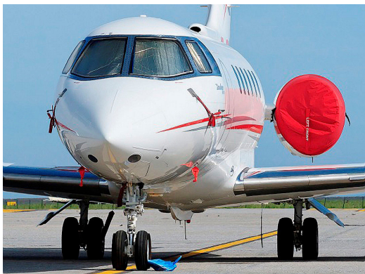
Hawker 800 Tri-Fold Engine Covers & Pitot Covers