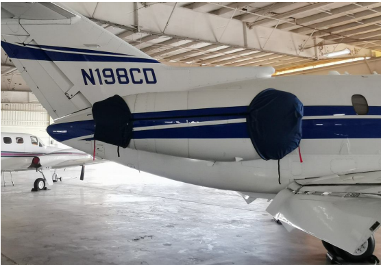
Hawker 750 Engine Covers