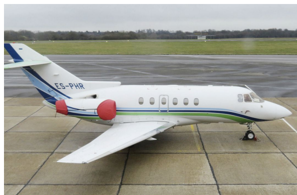
Hawker 750 Tri-Fold Engine Covers.