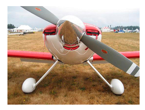
Harmon Rocket Engine Inlet Plugs

Engine Inlet Plugs are custom fit for your Harmon Rocket intakes, made with heavy-duty vinyl material, and stuffed with a single block of sculpted urethane foam. Each plug has a zipper that allows the foam to be removed and dried if necessary. Engine plugs have warning flags that are visible from the cockpit or 'remove before flight' streamers sewn onto the face of the plugs. Most plugs are imprinted with the aircraft registration number in black for an extra charge. Storage bag NOT included. Engine plugs may be inserted after flight when the engine is still warm. Engine Inlet Plugs are commonly referred to as Cowl Plugs, Intake Plugs, Cowl Blocks, Engine Blocks, and Engine Bungs.