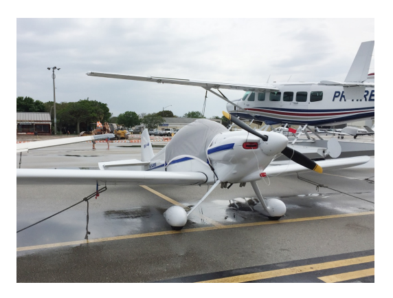
Harmon Rocket Travel Light Weight Canopy Cover Std Windshield