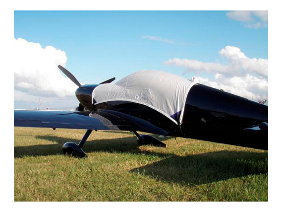
Harmon Rocket Canopy Cover & Engine Inlet Plugs