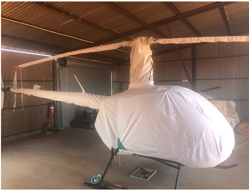
Robinson R-22 Full Cover Set