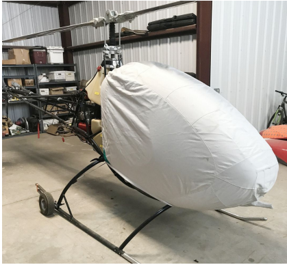
Helicycle Bubble Cover

This cover type is made from Silver Acrylic Sunbrella canvas and is 100% lined with a soft and smooth microfiber. Bruce's Custom Covers developed this material combination especially for aircraft protection. The outer material is medium weight and treated for water resistance, UV resistance and anti-static buildup. The inner lining is a very soft and smooth microfiber to prevent scratching. The material is very reflective, and tests show that the cabin interior temperature can be reduced to near-ambient temperature on the hottest of days. It is water, ice and snow repellent, yet breathable to allow moisture to escape from between the cover and the aircraft surface.