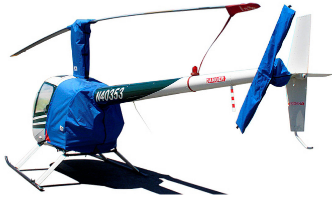
Robinson R-22 Engine, Rotor Mast & Tail Rotor Covers, with Blade Tie-down