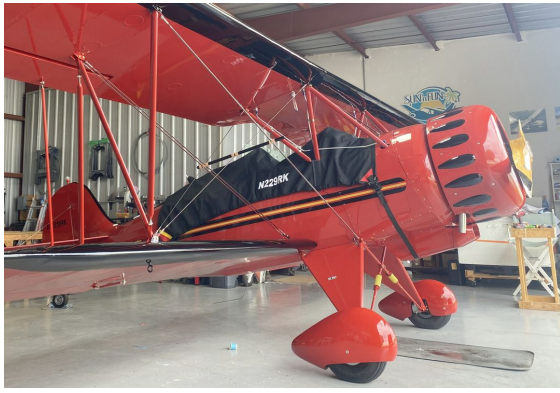
Biplane Hatz Classic Canopy Cover