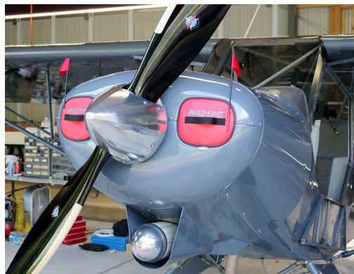
Piper PA-18 Super Cub Engine Inlet Plugs

Engine Inlet Plugs are custom fit for your Hatz Biplane CB-1 intakes, made with heavy-duty vinyl material, and stuffed with a single block of sculpted urethane foam. Each plug has a zipper that allows the foam to be removed and dried if necessary. Engine plugs have warning flags that are visible from the cockpit or 'remove before flight' streamers sewn onto the face of the plugs. Most plugs are imprinted with the aircraft registration number in black for an extra charge. Storage bag NOT included. Engine plugs may be inserted after flight when the engine is still warm. Engine Inlet Plugs are commonly referred to as Cowl Plugs, Intake Plugs, Cowl Blocks, Engine Blocks, and Engine Bungs.