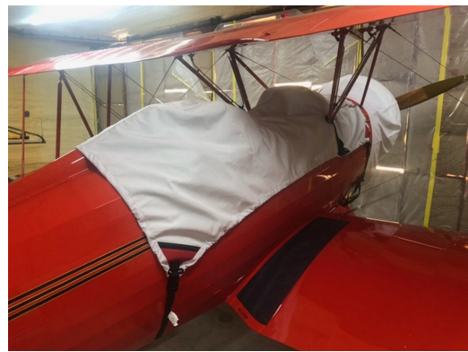
Hatz CB-1 Biplane Canopy & Engine Covers