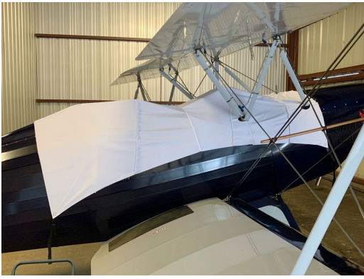
Hatz Biplane Canopy Cover, test fit cover