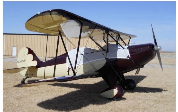
Hatz Biplane Canopy Cover