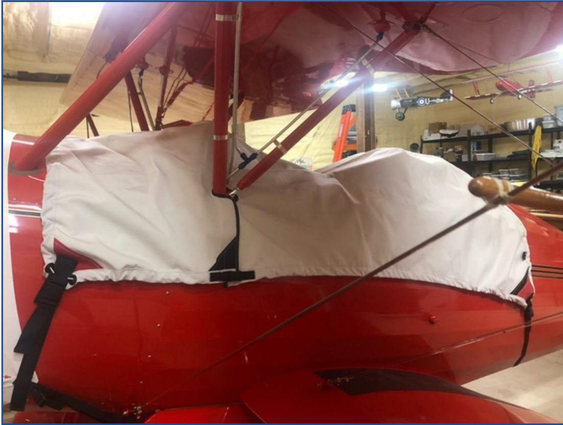
Hatz Biplane CB-1 Canopy Cover