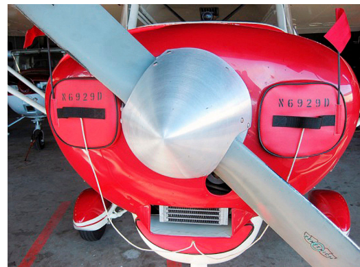
Piper PA-22-150 Engine Inlet Plugs (set of 3)