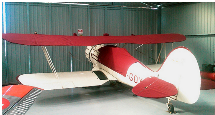
Waco UPF-7 Upper Wing Cover, Horizontal Stabilizer Cover & Canopy Cover

WINTER USE MATERIAL - Made with Solution-Dyed Polyester fabric, this option is intended for seasonal use to aid in deicing, rain mitigation, or for occasional travel. The material is lighter and more compact, but more susceptible to UV damage and may have a shorter useful life if used continuously outside than the all-year use material.