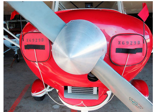
Piper PA-22-150 Engine Inlet Plugs (set of 3)