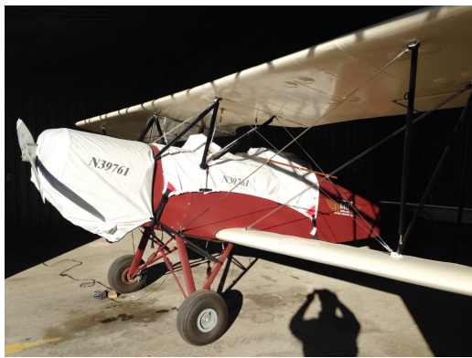
Hatz Biplane Canopy and Engine Covers