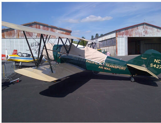
Travelair 4000 Canopy and Engine Cover