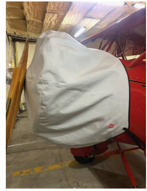
Hatz Biplane CB-1 Engine Cover