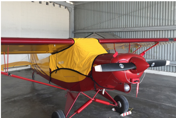
Piper Super Cub Canopy Cover, Engine Plugs

Engine Inlet Plugs are custom fit for your Hatz Biplane CB-1 intakes, made with heavy-duty vinyl material, and stuffed with a single block of sculpted urethane foam. Each plug has a zipper that allows the foam to be removed and dried if necessary. Engine plugs have warning flags that are visible from the cockpit or 'remove before flight' streamers sewn onto the face of the plugs. Most plugs are imprinted with the aircraft registration number in black for an extra charge. Storage bag NOT included. Engine plugs may be inserted after flight when the engine is still warm. Engine Inlet Plugs are commonly referred to as Cowl Plugs, Intake Plugs, Cowl Blocks, Engine Blocks, and Engine Bungs.