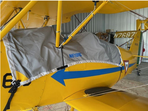
HATZ CB-1 Travel Cover, Light Weight Canopy Cover