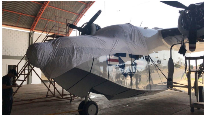
Grumman HU-16 Albatross Cockpit/Nose Cover (test fit cover)