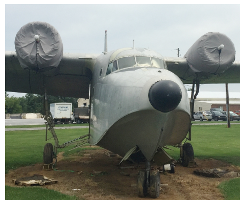
Grumman Albatross Engine Covers