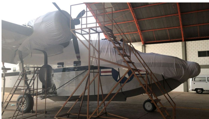
Grumman HU-16 Albatross Cockpit/Nose Cover and Engine Cover(test fit covers)

This cover type is made from Silver Acrylic Sunbrella canvas and is 100% lined with a soft and smooth microfiber. Bruce's Custom Covers developed this material combination especially for aircraft protection. The outer material is medium weight and treated for water resistance, UV resistance and anti-static buildup. The inner lining is a very soft and smooth microfiber to prevent scratching. The material is very reflective, and tests show that the cabin interior temperature can be reduced to near-ambient temperature on the hottest of days. It is water, ice and snow repellent, yet breathable to allow moisture to escape from between the cover and the aircraft surface.