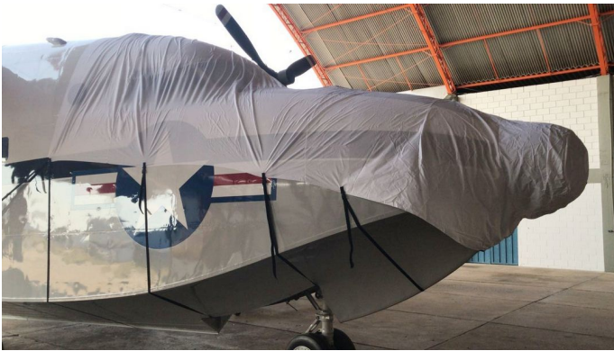
Grumman HU-16 Albatross Cockpit/Nose Cover (test fit cover)

This cover type is made from Silver Acrylic Sunbrella canvas and is 100% lined with a soft and smooth microfiber. Bruce's Custom Covers developed this material combination especially for aircraft protection. The outer material is medium weight and treated for water resistance, UV resistance and anti-static buildup. The inner lining is a very soft and smooth microfiber to prevent scratching. The material is very reflective, and tests show that the cabin interior temperature can be reduced to near-ambient temperature on the hottest of days. It is water, ice and snow repellent, yet breathable to allow moisture to escape from between the cover and the aircraft surface.