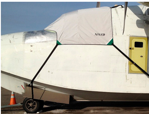
Grumman HU-16 Albatross Canopy Cover

This cover type is made from Silver Acrylic Sunbrella canvas and is 100% lined with a soft and smooth microfiber. Bruce's Custom Covers developed this material combination especially for aircraft protection. The outer material is medium weight and treated for water resistance, UV resistance and anti-static buildup. The inner lining is a very soft and smooth microfiber to prevent scratching. The material is very reflective, and tests show that the cabin interior temperature can be reduced to near-ambient temperature on the hottest of days. It is water, ice and snow repellent, yet breathable to allow moisture to escape from between the cover and the aircraft surface.