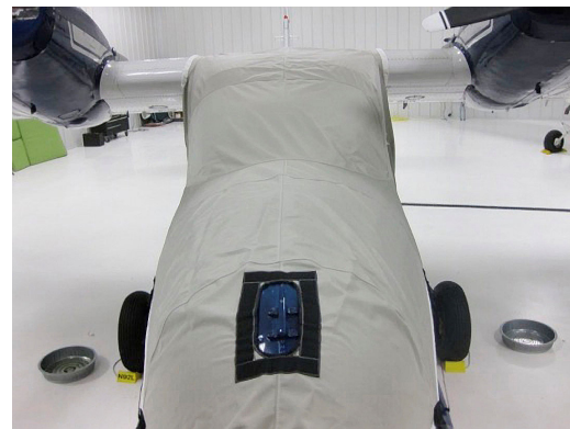
Grumman Widgeon Cockpit/Nose Cover, tie-down cleat detail