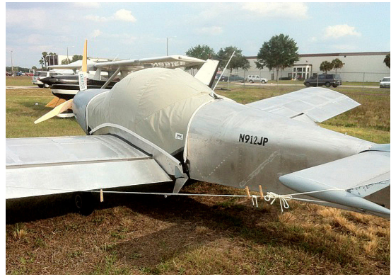
Zenith 601 XL Canopy Cover