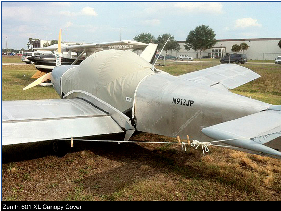
Zenith 601 XL Canopy Cover