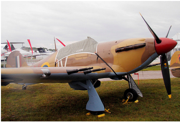
Hawker Hurricane Canopy Cover