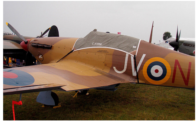
Hawker Hurricane Canopy Cover