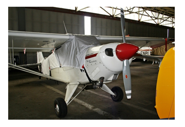
Aviat Husky Canopy Cover, Empennage Cover