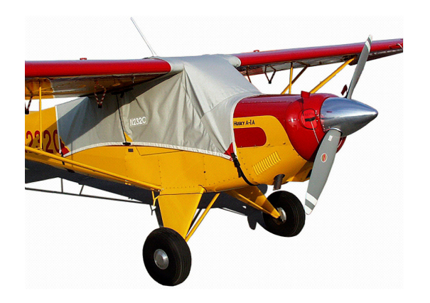
Aviat Husky Canopy Cover & Engine Plugs