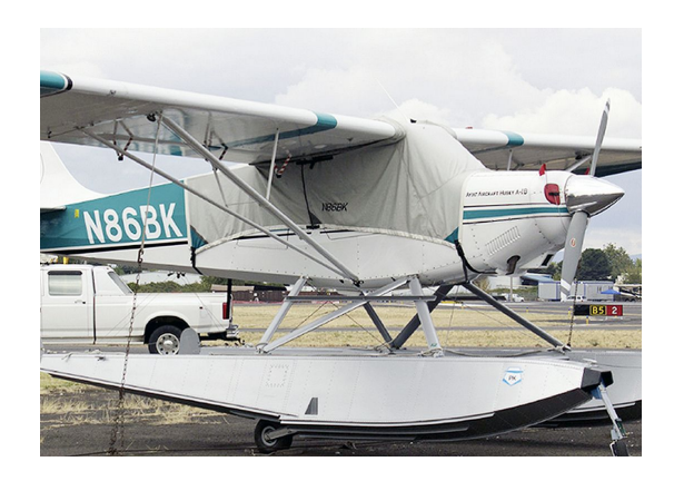
Aviat Husky Canopy Cover and Inlet Plugs

Engine Inlet Plugs are custom fit for your Aviat (Christen) Husky intakes, made with heavy-duty vinyl material, and stuffed with a single block of sculpted urethane foam. Each plug has a zipper that allows the foam to be removed and dried if necessary. Engine plugs have warning flags that are visible from the cockpit or 'remove before flight' streamers sewn onto the face of the plugs. Most plugs are imprinted with the aircraft registration number in black for an extra charge. Storage bag NOT included. Engine plugs may be inserted after flight when the engine is still warm. Engine Inlet Plugs are commonly referred to as Cowl Plugs, Intake Plugs, Cowl Blocks, Engine Blocks, and Engine Bungs.