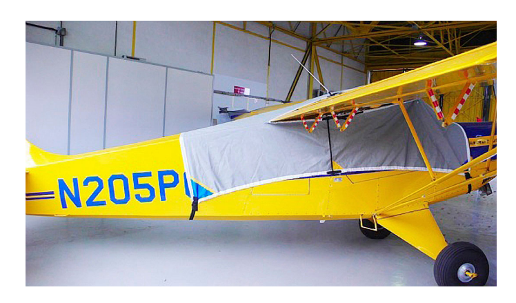
Aviat Husky Canopy Cover