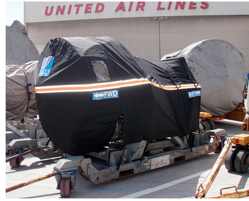
IAE V2500 QEC OFF-LINK JET ENGINE COVER, "rain cap" style