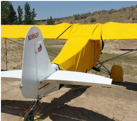
Piper PA-18 Super Cub Extended Canopy Cover, Wing & Tire Covers