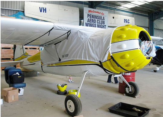
Cessna 195 Canopy Cover, over-top, 24" fwd ext to cover cowl ring gap, gas cap ext.

This cover type is made from Silver Acrylic Sunbrella canvas and is 100% lined with a soft and smooth microfiber. Bruce's Custom Covers developed this material combination especially for aircraft protection. The outer material is medium weight and treated for water resistance, UV resistance and anti-static buildup. The inner lining is a very soft and smooth microfiber to prevent scratching. The material is very reflective, and tests show that the cabin interior temperature can be reduced to near-ambient temperature on the hottest of days. It is water, ice and snow repellent, yet breathable to allow moisture to escape from between the cover and the aircraft surface.