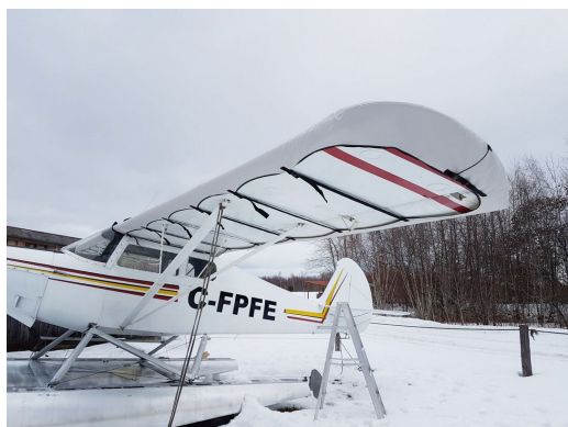
Christavia Mk 1 Wing Covers

WINTER USE MATERIAL - Made with Solution-Dyed Polyester fabric, this option is intended for seasonal use to aid in deicing, rain mitigation, or for occasional travel. The material is lighter and more compact, but more susceptible to UV damage and may have a shorter useful life if used continuously outside than the all-year use material.