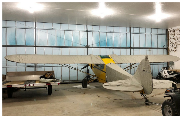
Piper Super Cub Wing &amp; Empennage Covers