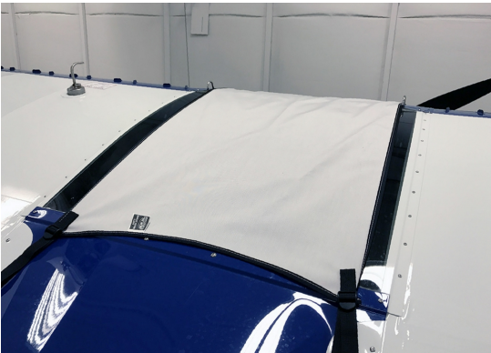
Cub Crafters CC-11 Windshield Cover