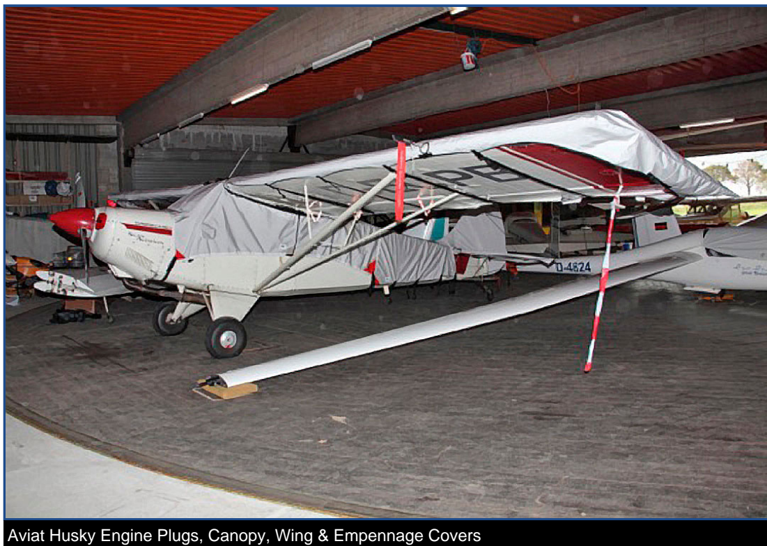
Aviat Husky Engine Plugs, Canopy, Wing &amp; Empennage Covers