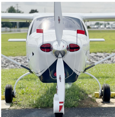
Jabiru J230-SP Engine Inlet Plugs