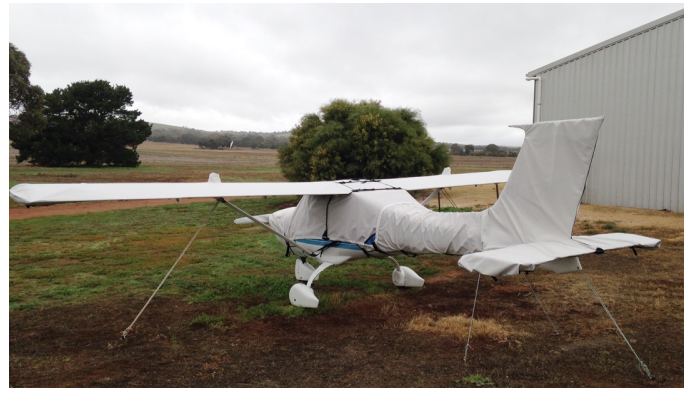
Jabiru 160 Canopy, Engine, Prop, Wings & Empennage Covers Jabiru 160 Canopy, Engine, Prop, Wings & Empennage Covers