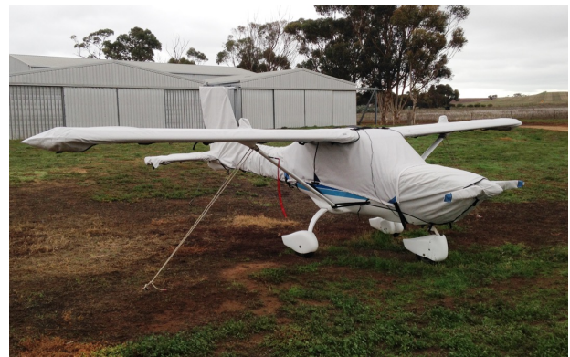
Jabiru 160 Canopy, Engine, Prop, Wings & Empennage Covers Jabiru 160 Canopy, Engine, Prop, Wings & Empennage Covers