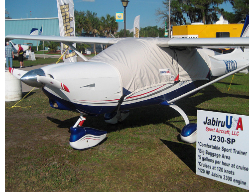
Jabiru 230-SP Canopy Cover, Over-top style