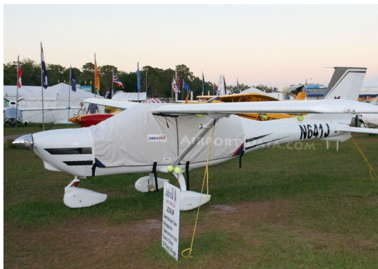
Jabiru J230 Canopy Cover

This cover type is made from Silver Acrylic Sunbrella canvas and is 100% lined with a soft and smooth microfiber. Bruce's Custom Covers developed this material combination especially for aircraft protection. The outer material is medium weight and treated for water resistance, UV resistance and anti-static buildup. The inner lining is a very soft and smooth microfiber to prevent scratching. The material is very reflective, and tests show that the cabin interior temperature can be reduced to near-ambient temperature on the hottest of days. It is water, ice and snow repellent, yet breathable to allow moisture to escape from between the cover and the aircraft surface.