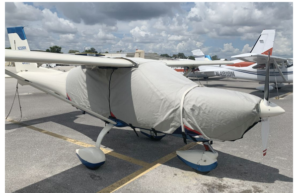
Jabiru 230D Extended Canopy Cover & Engine Covers