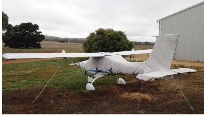
Jabiru 160 Canopy, Engine, Prop, Wings & Empennage Covers Jabiru 160 Canopy, Engine, Prop, Wings & Empennage Covers