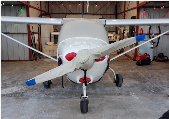
Jabiru J250 Canopy & Prop Cover

This cover type is made from Silver Acrylic Sunbrella canvas and is 100% lined with a soft and smooth microfiber. Bruce's Custom Covers developed this material combination especially for aircraft protection. The outer material is medium weight and treated for water resistance, UV resistance and anti-static buildup. The inner lining is a very soft and smooth microfiber to prevent scratching. The material is very reflective, and tests show that the cabin interior temperature can be reduced to near-ambient temperature on the hottest of days. It is water, ice and snow repellent, yet breathable to allow moisture to escape from between the cover and the aircraft surface.