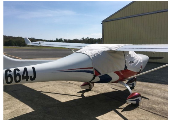
Jabiru J230-SP Canopy Cover, Over-Top Style