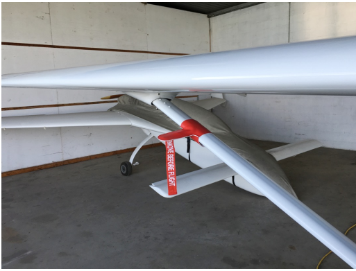
Jabiru Pitot Cover