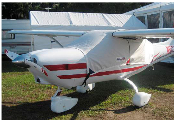
Jabiru 230-SP Canopy Cover, Over-top style