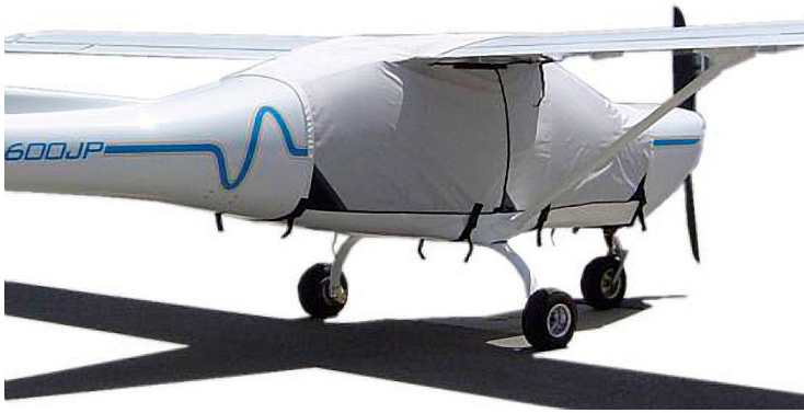
Jabiru Extended Canopy Cover