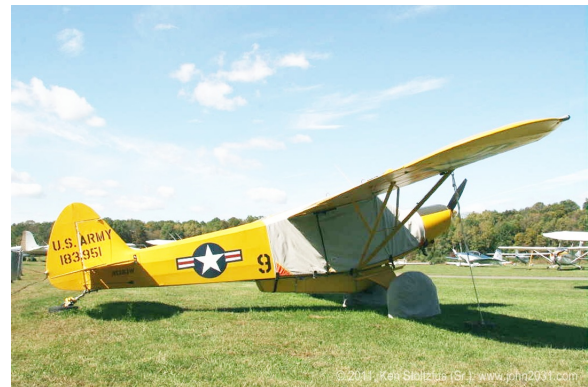
Piper L-21b Extended Canopy Cover, Tire Covers