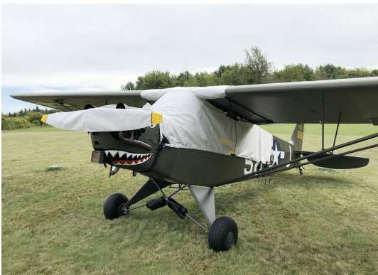
Piper L-4 Over-Top Canopy Cover, Prop Cover

This cover type is made from Silver Acrylic Sunbrella canvas and is 100% lined with a soft and smooth microfiber. Bruce's Custom Covers developed this material combination especially for aircraft protection. The outer material is medium weight and treated for water resistance, UV resistance and anti-static buildup. The inner lining is a very soft and smooth microfiber to prevent scratching. The material is very reflective, and tests show that the cabin interior temperature can be reduced to near-ambient temperature on the hottest of days. It is water, ice and snow repellent, yet breathable to allow moisture to escape from between the cover and the aircraft surface.