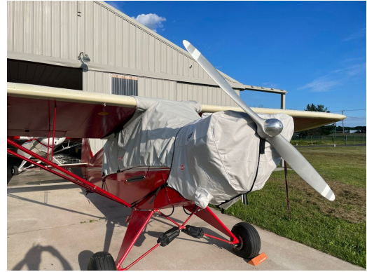
Piper J3 Cub Travel Weight Canopy & Engine Cover