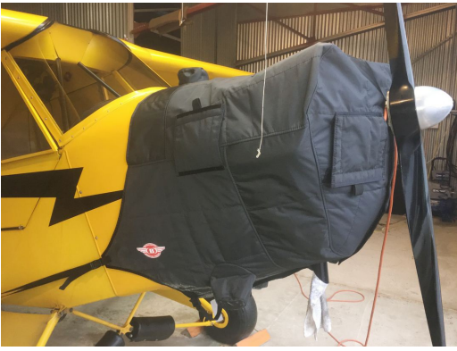
Piper J3 Cub Insulated Engine Cover