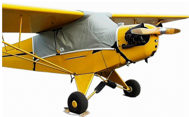
Piper J3 Canopy Cover

This cover type is made from Silver Acrylic Sunbrella canvas and is 100% lined with a soft and smooth microfiber. Bruce's Custom Covers developed this material combination especially for aircraft protection. The outer material is medium weight and treated for water resistance, UV resistance and anti-static buildup. The inner lining is a very soft and smooth microfiber to prevent scratching. The material is very reflective, and tests show that the cabin interior temperature can be reduced to near-ambient temperature on the hottest of days. It is water, ice and snow repellent, yet breathable to allow moisture to escape from between the cover and the aircraft surface.