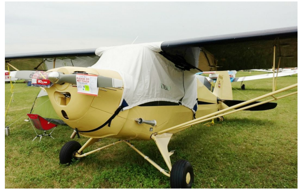
Piper J-4 Cub Coupe Canopy Cover (Over-Top)