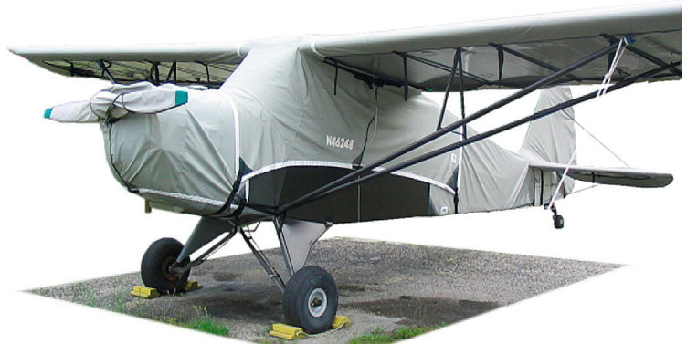
Prop Cover, Engine Cover, Canopy Cover, Wing Covers and Empennage Cover