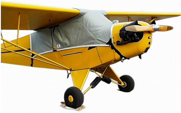
Piper J3 Canopy Cover