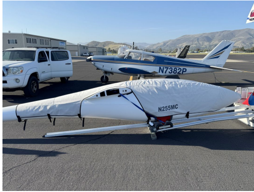
Jonker Sailplanes Canopy/Nose Cover, Extended To Cover Turtledeck