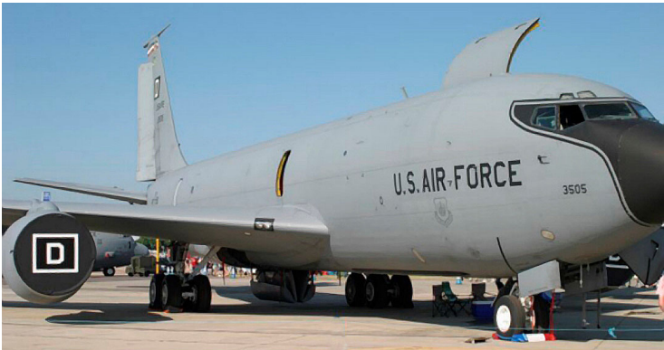
KC-135R Intake Covers w/ artwork