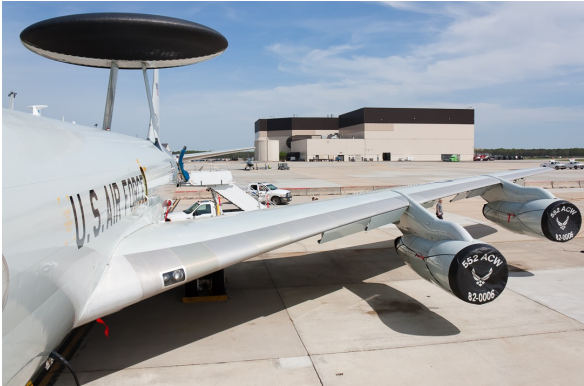
Boeing E-3C Engine Covers

The Engine Inlet Plugs are custom fit for your Boeing KC-135, C-135, RC-135, EC-135 intakes, made with heavy-duty vinyl material, and stuffed with a single block of sculpted urethane foam. Each plug has a zipper that allows the foam to be removed and dried if necessary. Engine plugs have 'remove before flight' streamers sewn onto the face of the plugs. Most plugs are imprinted with the aircraft registration number in black for an extra charge. Storage bag NOT included. Engine plugs may be inserted after flight when the engine is still warm. Engine Inlet Plugs are commonly referred to as Cowl Plugs, Intake Plugs, Cowl Blocks, Engine Blocks, and Engine Bungs.