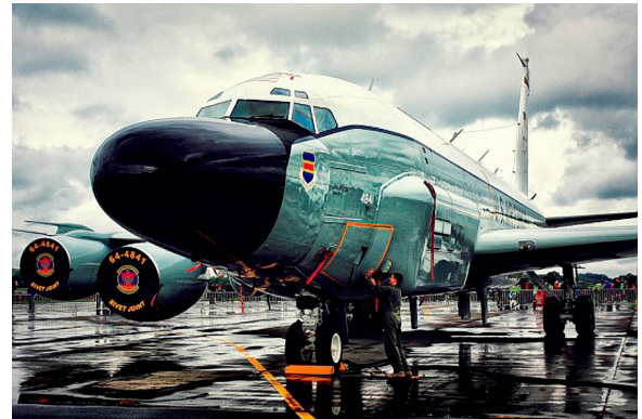
KC-135 "Tamboirine" type Intake Covers