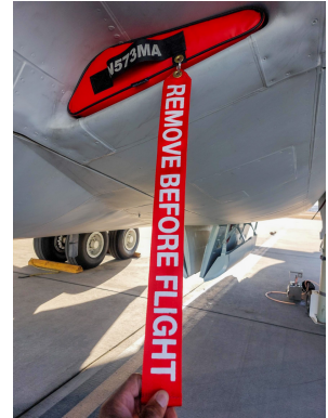
KC-135 ACM Inlet Plug