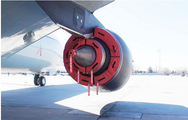
RC-135W Bypass Vent and Exhaust Plugs