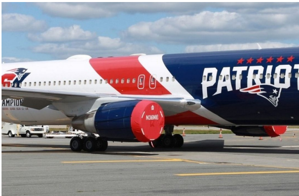
Boeing 767 Intake Covers