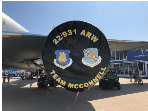
Boeing KC-46 Intake Cover