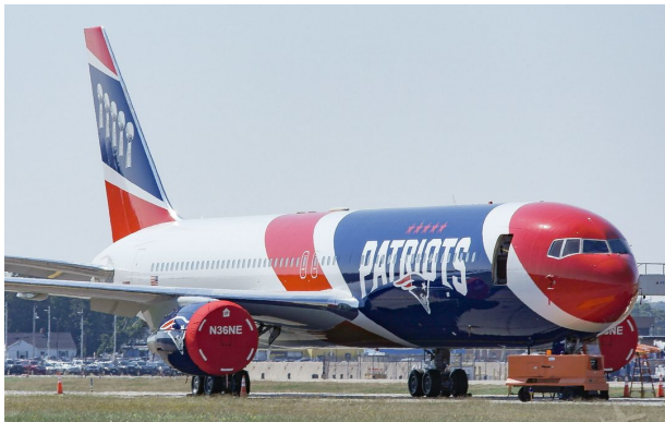
Boeing 767 Intake Covers