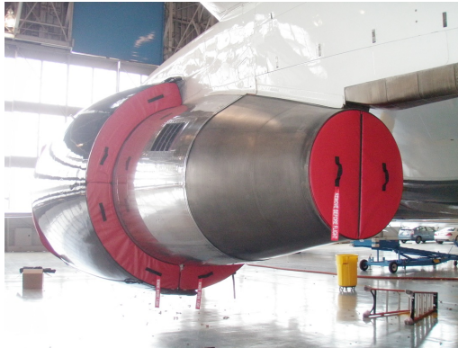
Exhaust Plugs Ship Set, incl. Fan Thrust Reverser and Exhaust Plugs P/N: B767-200