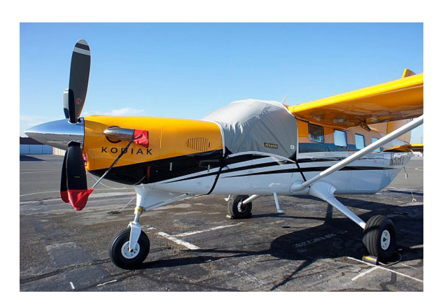
Quest Kodiak Cockpit Cover, Engine Plugs, Prop Tie/Exhaust Covers, & Cabin HeatShields set