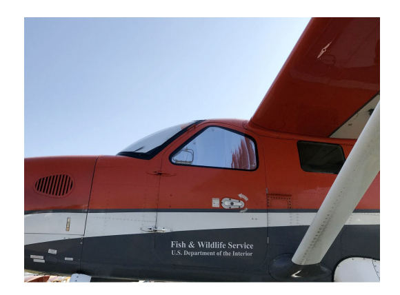
Quest Kodiak Cockpit HeatShields

Cockpit Heatshields are interior sunshades for the aircraft's cockpit. The product is a unique composite of closed-cell foam with a silver mylar finish. The semi-rigid design is stiff enough to stand inside the window framing. The set folds up flat and is easily stored in the included storage sleeve. Some designs may require velcro and suction cups. A Heatshield is an excellent short-term remedy for cockpit overheating, but an external fabric cover is more effective for long-term protection.