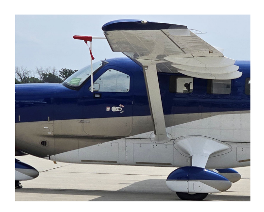
Quest Aircraft Kodiak Cockpit Heatshields