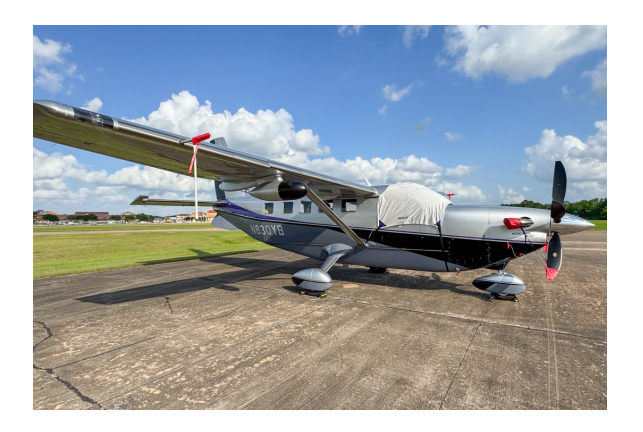
Quest Kodiak Engine Plugs, Prop Tie-Down & Exhaust Covers Kodiak 200 Cockpit Cover, Pitot Cover, Prop Tie/Exhaust Cover