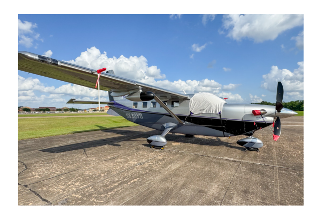
Kodiak 200 Cockpit Cover, Pitot Cover, Prop Tie/Exhaust Cover

This cover type is made from Silver Acrylic Sunbrella canvas and is 100% lined with a soft and smooth microfiber. Bruce's Custom Covers developed this material combination especially for aircraft protection. The outer material is medium weight and treated for water resistance, UV resistance and anti-static buildup. The inner lining is a very soft and smooth microfiber to prevent scratching. The material is very reflective, and tests show that the cabin interior temperature can be reduced to near-ambient temperature on the hottest of days. It is water, ice and snow repellent, yet breathable to allow moisture to escape from between the cover and the aircraft surface.