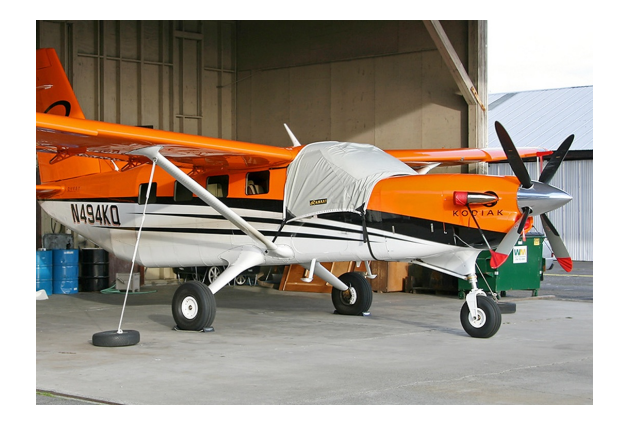
Kodiak 200 Cockpit Cover, Pitot Cover, Prop Tie/Exhaust Quest Kodiak Windshield Cover, Prop Tie/Exhaust Covers, Engine Inlet Cover Plugs & Pitot Cover