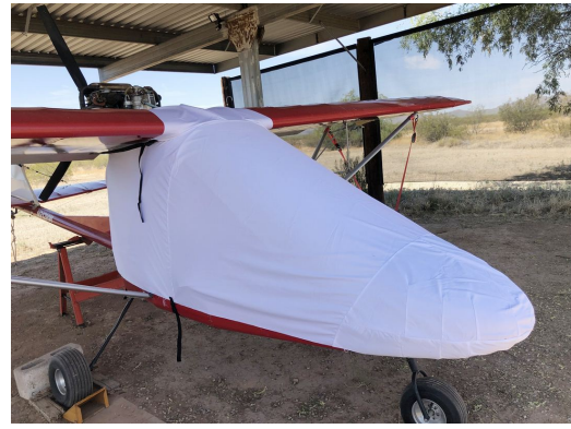
Rans S-12 Airaile Canopy/Nose Cover (test fit cover)