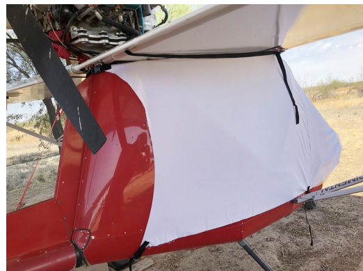
Rans S-12 Airaille Canopy/Nose Cover (test fit cover)