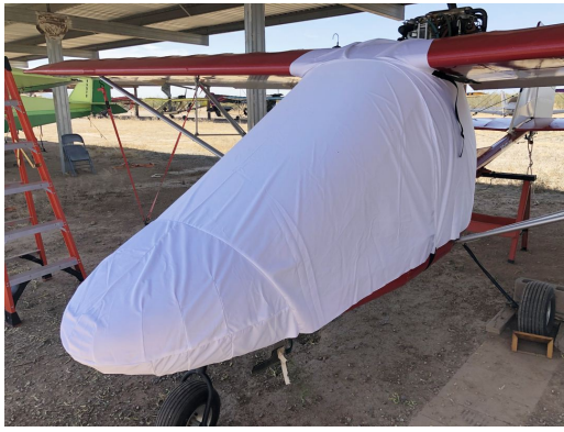
Rans S-12 Airaile Canopy/Nose Cover (test fit cover)