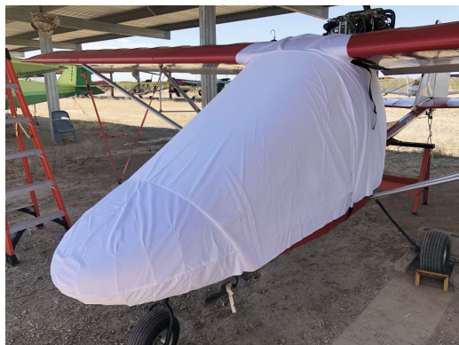
Rans S-12 Airaille Canopy/Nose Cover (test fit cover)

Travel Covers are made with Silver Solution-Dyed Polyester fabric and only lined over the windshield to save weight. The material is lightweight and more compact for easy stowage in the aircraft. The polyester material is water resistant, but only intended for occasional use outside. We also have an ultra lightweight material available for fitted hangar dust covers. For daily outdoor use, the non-travel Sunbrella Cover is the best choice.