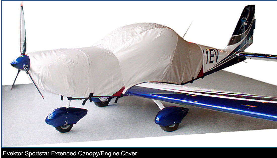
Evektor Sportstar Extended Canopy/Engine Cover