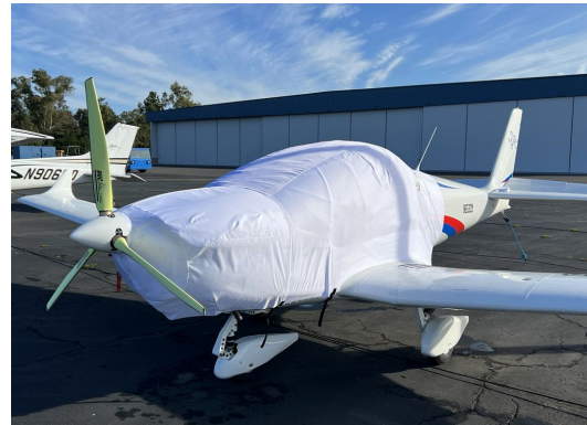
Jihlavan JA-600 Skyleader Extended Canopy/Engine Cover, test fit cover