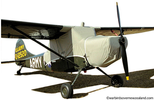
Cessna L-19 Canopy & Engine Covers