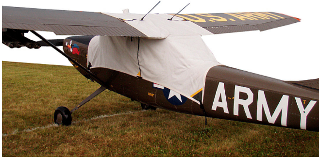
L-19 Canopy Cover

water resistance, UV resistance and anti-static buildup. The inner lining is a very soft and smooth microfiber to prevent scratching. The material is very reflective, and tests show that the cabin interior temperature can be reduced to near-ambient temperature on the hottest of days. It is water, ice and snow repellent, yet breathable to allow moisture to escape from between the cover and the aircraft surface.