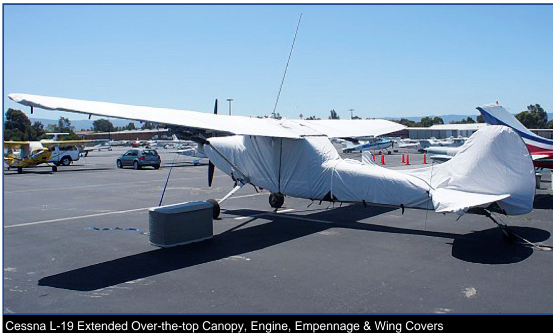
Cessna L-19 Extended Over-the-top Canopy, Engine, Empennage &amp; Wing Covers