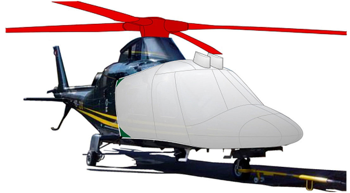
Agusta 109 Bubble, Rotor Hub & Blade Covers (illustration)