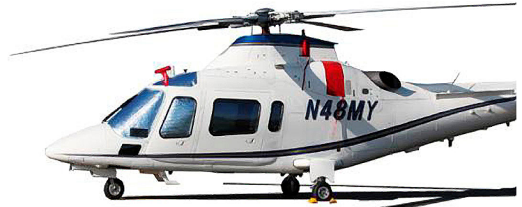
Agusta 109 Bubble, Rotor Hub & Blade Covers (illustration) Agusta Power Pitot Covers, Intake Covers, and Cockpit Heatshield set