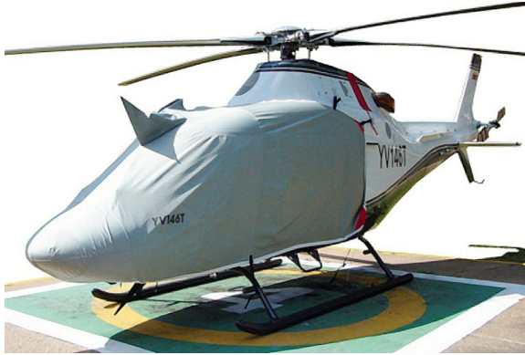
Koala Bubble Cover (with Wire Strike)

Travel Covers are made with Silver Solution-Dyed Polyester fabric and fully lined over the entire cover. The material is lightweight and more compact for easy stowage in the aircraft. The polyester material is water resistant, but only intended for occasional use outside. We also have an ultra lightweight material available for fitted hangar dust covers. For daily outdoor use, the non-travel Sunbrella Cover is the best choice.