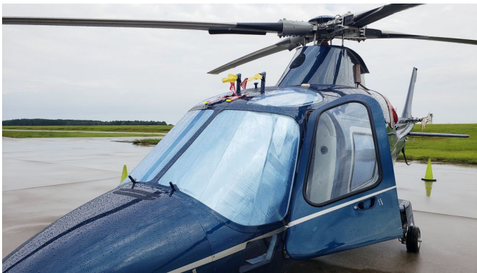
Agusta AW109S/SP Grand Heatshield Set

Cabin Heatshields are interior sunshades for the aircraft's passenger cabin area. The product is a unique composite of closed-cell foam with a silver mylar finish. The semi-rigid design is stiff enough to stand inside the window framing. The set folds up flat and is easily stored in the included storage sleeve. Some designs may require velcro and suction cups. A Heatshield is an excellent short-term remedy for cockpit overheating, but an external fabric cover is more effective for long-term protection.