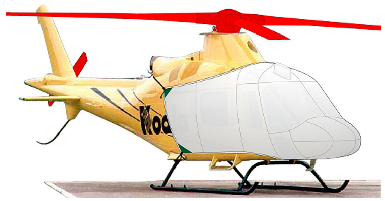
Koala Bubble, Rotor Hub, Blade & Tail Rotor Covers (illustration)