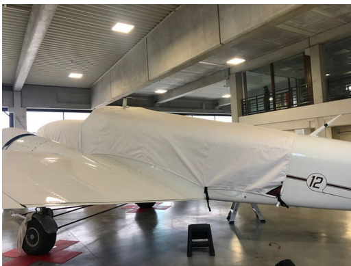
Lockheed 12 Canopy/Nose Cover

This cover type is made from Silver Acrylic Sunbrella canvas and is 100% lined with a soft and smooth microfiber. Bruce's Custom Covers developed this material combination especially for aircraft protection. The outer material is medium weight and treated for water resistance, UV resistance and anti-static buildup. The inner lining is a very soft and smooth microfiber to prevent scratching. The material is very reflective, and tests show that the cabin interior temperature can be reduced to near-ambient temperature on the hottest of days. It is water, ice and snow repellent, yet breathable to allow moisture to escape from between the cover and the aircraft surface.