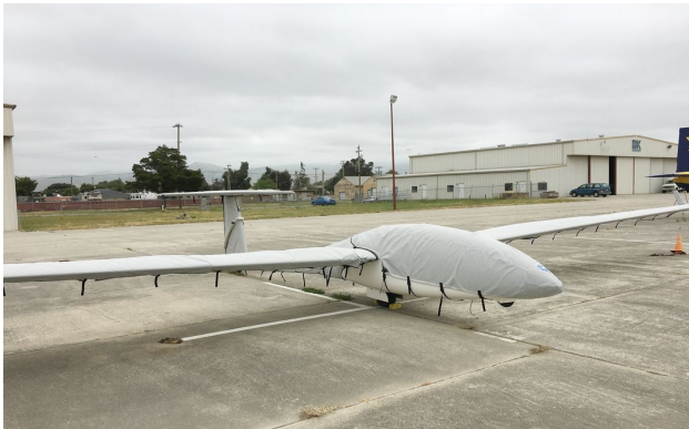
DG-505 Canopy/Nose, Wing, Empennage & Horiz. Stab. Covers