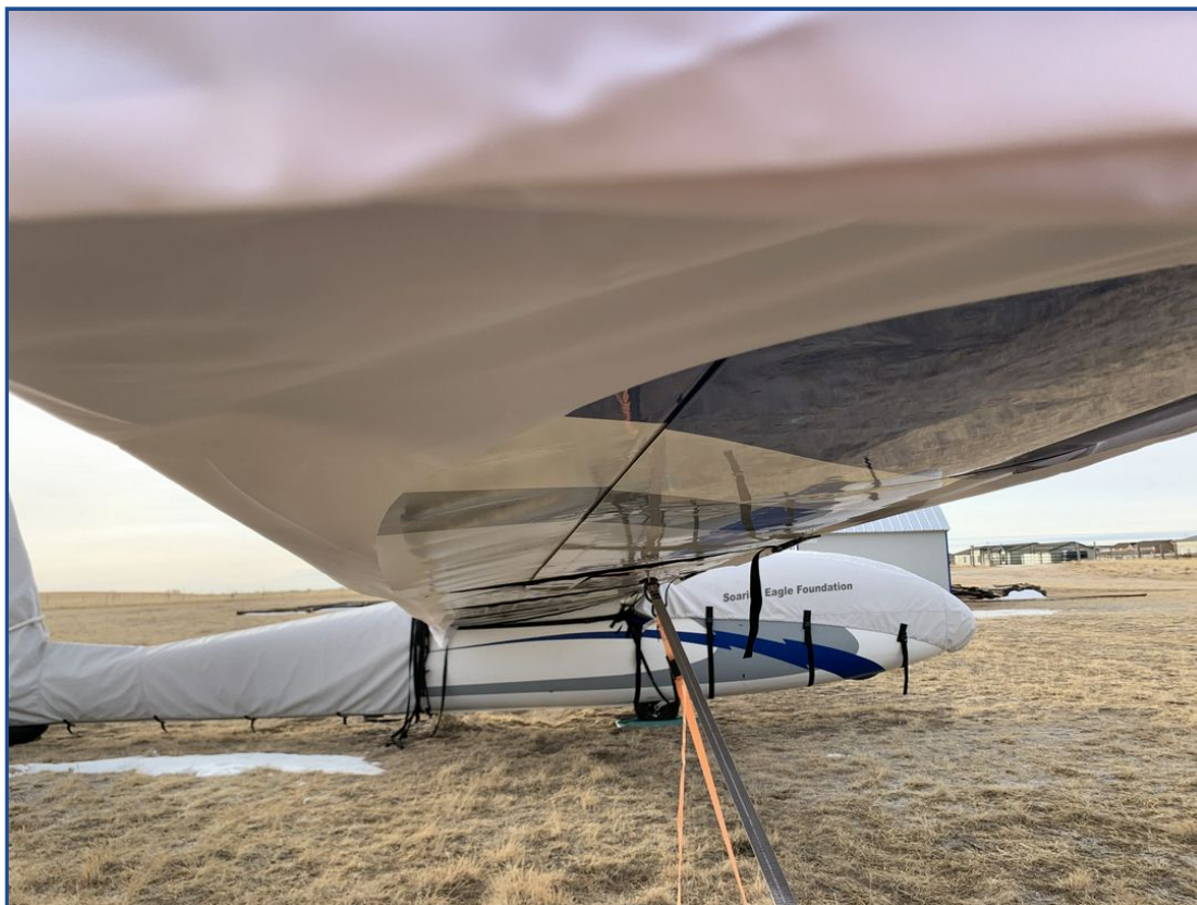
Blanik L-13 Canopy/Nose & Empennage Covers