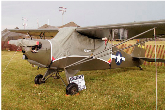
Aeronca 7AC Champ Canopy & Prop Covers

This cover type is made from Silver Acrylic Sunbrella canvas and is 100% lined with a soft and smooth microfiber. Bruce's Custom Covers developed this material combination especially for aircraft protection. The outer material is medium weight and treated for water resistance, UV resistance and anti-static buildup. The inner lining is a very soft and smooth microfiber to prevent scratching. The material is very reflective, and tests show that the cabin interior temperature can be reduced to near-ambient temperature on the hottest of days. It is water, ice and snow repellent, yet breathable to allow moisture to escape from between the cover and the aircraft surface.