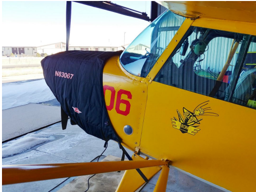
Aeronca Champ 7AC Insulated Engine Cover

This cover type is made from Silver Acrylic Sunbrella canvas and is 100% lined with a soft and smooth microfiber. Bruce's Custom Covers developed this material combination especially for aircraft protection. The outer material is medium weight and treated for water resistance, UV resistance and anti-static buildup. The inner lining is a very soft and smooth microfiber to prevent scratching. The material is very reflective, and tests show that the cabin interior temperature can be reduced to near-ambient temperature on the hottest of days. It is water, ice and snow repellent, yet breathable to allow moisture to escape from between the cover and the aircraft surface.