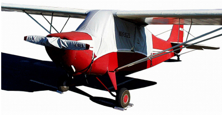
Aeronca Champ Canopy & Prop Covers