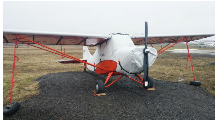
Aeronca Champ 7EC Canopy, Engine, Wing & Empennage Covers