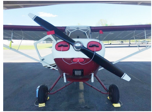
Aeronca Champ 7AC, 7EC Engine Inlet Plugs