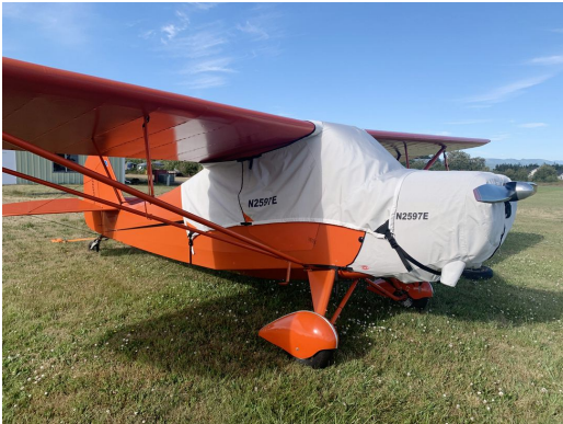
Aeronca 7AC Champ Over-Top Canopy Cover & Engine Cover