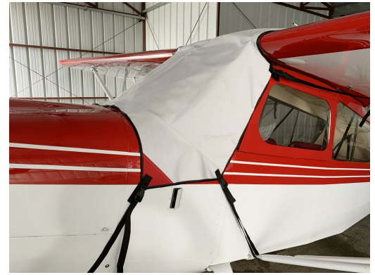
Bellanca Citabria Windshield/Skylight Cover