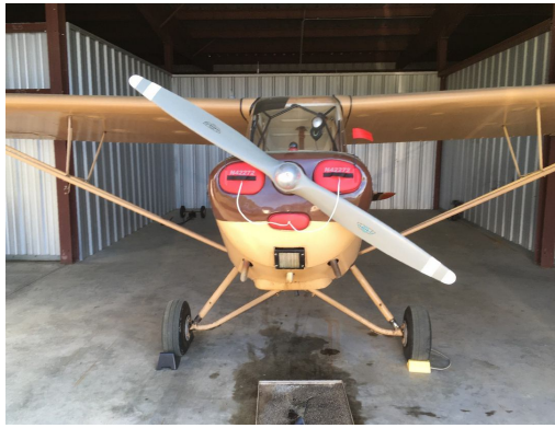
Aeronca Champ Engine Plugs, set of 3