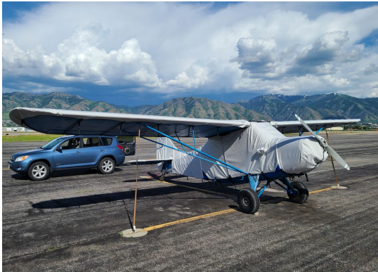
Champion 7EC Complete Cover Set

This cover type is made from Silver Acrylic Sunbrella canvas and is 100% lined with a soft and smooth microfiber. Bruce's Custom Covers developed this material combination especially for aircraft protection. The outer material is medium weight and treated for water resistance, UV resistance and anti-static buildup. The inner lining is a very soft and smooth microfiber to prevent scratching. The material is very reflective, and tests show that the cabin interior temperature can be reduced to near-ambient temperature on the hottest of days. It is water, ice and snow repellent, yet breathable to allow moisture to escape from between the cover and the aircraft surface.