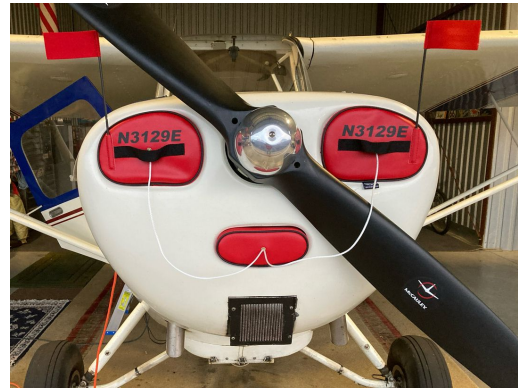
Aeronca Champ Engine Plugs