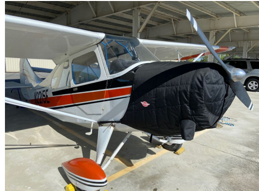
Aeronca Champ 7AC Insulated Engine Cover