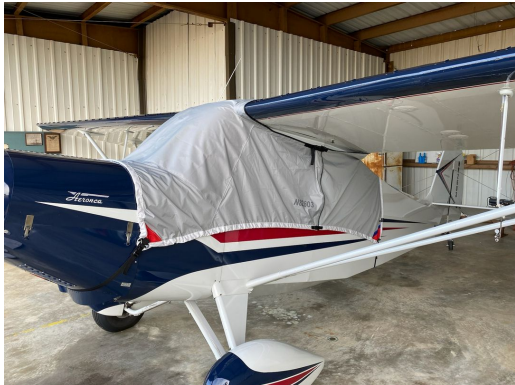
Aeronca Champ Travel Weight Canopy Cover