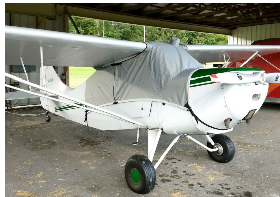
Aeronca Champ Light Weight Travel Canopy Cover, Over-Top Style