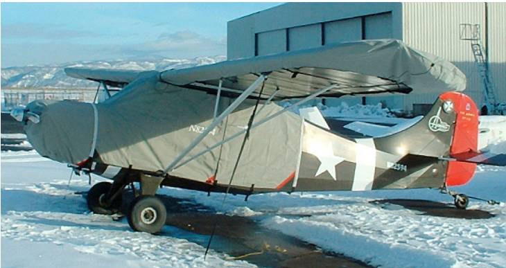
Aeronca Champ Canopy, Wings, Engine & Empennage (test fit) Covers