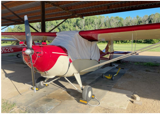
Aeronca Champ Over-Top Canopy Cover, Engine Plugs